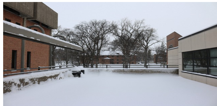
Campus beauty in the bleak mid-winter

BOOKSTORE DISCOUNT: UMMRA members receive a 10% discount at the University of Minnesota, Morris bookstore location with an UMMRA membership card . This discount is good on apparel, insignia gift items, general books and supplies. The bookstore discount excludes textbooks, computer hardware and software, graduation items, class rings, medical reference books and medical supplies. Savings are not valid in combination with other coupon or membership offers.