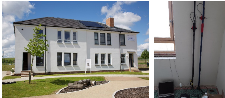
Figure 2. Case study; the heat flux plates, thermistors and dataloggers recording the readings

BRE conducted U-value measurements in an upstairs flat (Flat 'F2'), that is a replica of a typical 1960s four-in-a-block unit, with the Wall-ACE insulating plaster added as a 'retrofit' measure. A first layer of Wall-ACE insulation was applied in September 2018 and a second layer in February 2019. The U-value of the external wall was measured at four positions during March and April 2019. Equipment was installed and heating supplied to the flat, and heat flow and temperatures were monitored at regular intervals.