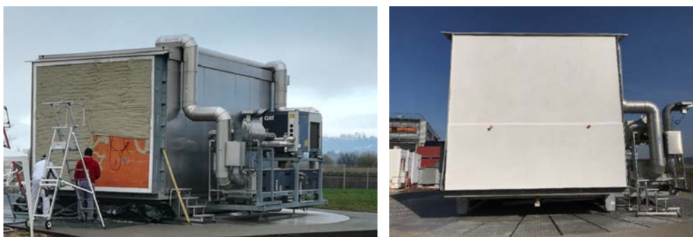
Figure 4. PASSYS test cell installation (all project products)