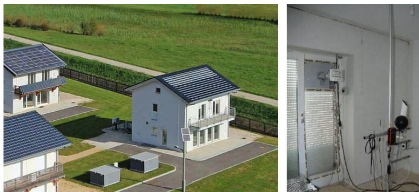
Figure 5. The French case study (INCAS test houses)

As a demo activity, thermal coating finish was installed in a test room in one of the 4 test houses of INCAS's platform (Figure 5). This house is a recently built high energy performing one, where the test room is compared with a reference room from an environmental quality point of view: thermal comfort and indoor air quality are recorded.