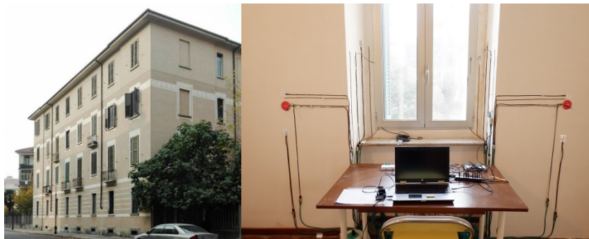
Figure 1. The Italian case study (ATC building).

The monitoring phase on the developed products started in November 2018 and will continue until the end of the project (September 2019).