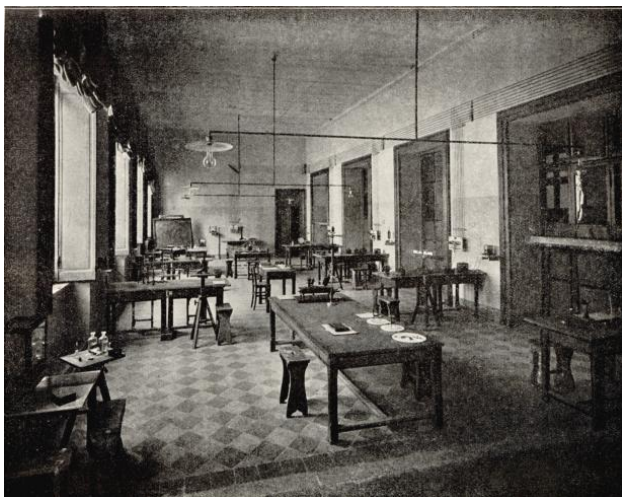
Fig. 2. The Laboratory of Fisica Sperimentale of the Museo Industriale.

Regio Museo Industriale were moved to Castello del Valentino, located in the central building of the castle and opened to public, as well as those of the Scuola di applicazione per gli ingegneri located in a wing of the castle. The Politecnico owned and managed the Museo di Geologia e Mineralogia and the Museo Industriale. In addition to these museums, there were also rich collections of didactic artefacts, such as the collection of materials of the Gabinetto di Architettura Antica e Tecnica degli Stili, or the Curioni Collection of Modelli di costruzioni or the collections of the Modelli di Meccanica or of the Strumenti di Topografia. After some movements of the collections from the Castello del Valentino to via dell'Ospedale, in the night of 8 th December 1942, during a bombing of allied forces, the Museo Industriale was laid to the ground and only a few pieces of the collections survived, in particular those belonging to the Museo di Geologia e Mineralogia relocated to the Museo Industriale in 1936, occupying the spaces left free from the Scuola di Elettrotecnica moved to new headquarters. After the bombing, the surviving material was moved to the Castello del Valentino, waiting for the definitive transfer in 1958 in the new building of Politecnico in Corso Duca degli Abruzzi.