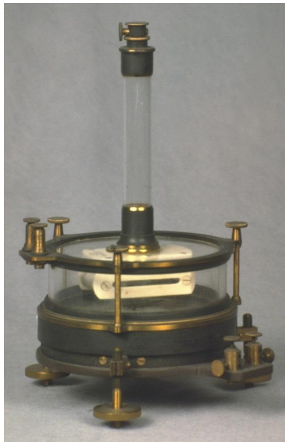
Fig. 7. Nobili galvanometer