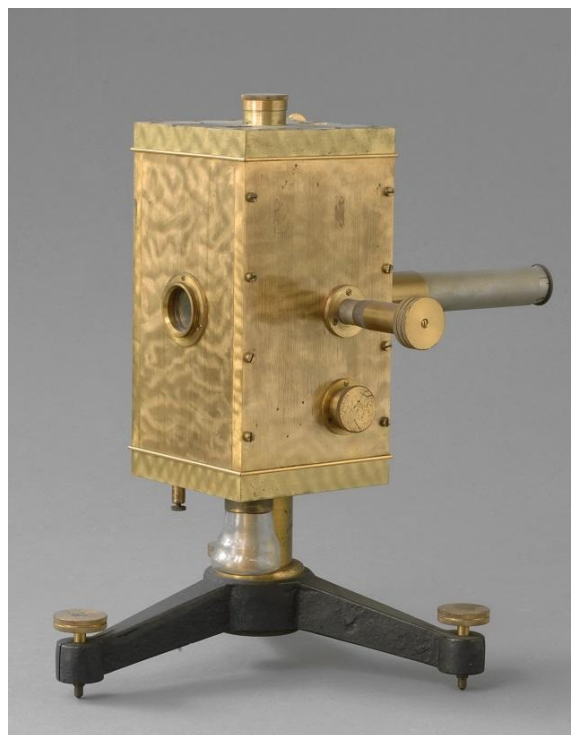
Fig. 3. New Leiss electrometer (Modello Perucca 1926) thin wire (inventory n. 50)

The collection of electrical measuring instruments and equipment includes electrometers, galvanometers, ammeters, voltmeters, used for teaching and research from 1920 to 1960. The Perucca's wire tapping electrometer (1927), the static galvanometer for direct current of Nobili and the Ayrton-Mather. There are also three sets of scientific instruments for didactic purposes, one for induced currents experiences, one for experiences under vacuum, one for experiences with rarefied gas, kept at the Physics Department. The first collection includes educational tools, including Rühmkorff's spool, Righi's oscillator, Tesla's transformer, Pacinotti's ring, and Palmieri's circle. Pioneering equipment in the vacuum field forms the second collection. Some molecular pumps such as Gaede (1930) and other equipment, built between 1920 and 1930, were used for electrology experiments by Eligio Perucca. The third collection includes instruments for the study of discharges into rarefied gases, including Geissler tube, Röntgen tubes with regulator, Lecher tube, incandescent lamps (Edison effect) and Crookes radiometer.