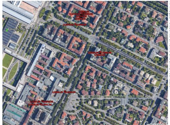
FIGURE 1 Misplaced Galileo and GPS + Galileo solutions.