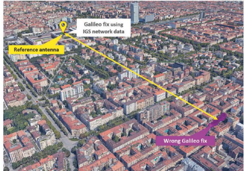
FIGURE 2 Comparison of Galileo-only solutions using Navigation message ephemeris data and IGS ephemeris.

In fact, the document specifies that “The navigation solution is expected to meet the Minimum Performance Levels only if receivers do not use navigation parameters beyond their