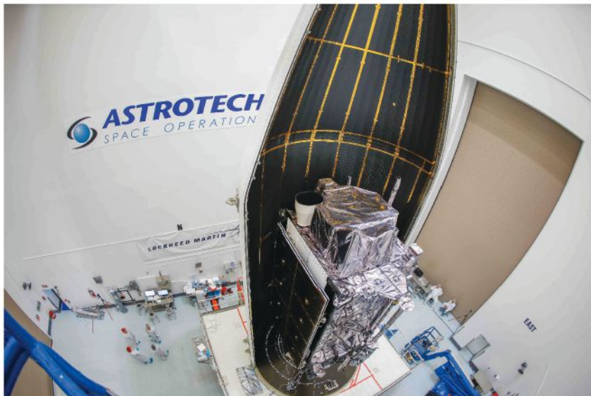
THE SECOND GPS III satellite is encapsulated in preparation for launch on August 23.

Additional GPS IIIIF capabilities will start being added with the 11th GPS III satellite. These will include a fully digital navigation payload, a Regional Military Protection (RMP) capability, an accuracy-enhancing laser retroreflector array, and a search-and-rescue payload. 🌐