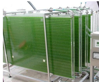
Fig. 3. Bioreactor (Bioneer Greenenergy)

bottles, branches, fish etc. from clogging the system. An algae initiator would be placed inside a bioreactor to grow by absorbing dissolved nitrogen and other minerals, see Fig. 3. Clean water would then be passed through a series of filters to avoid the seepage of algae into the water body. Species native to the water body, typically Spirulina or Chlorella , would be used so as to not disturb the ecosystem balance. Algae has a higher N absorption rate as compared to other plants and it grows much faster. Considering an absorption rate of 25 mg/l, which is typical for Chlorella , and a bioreactor of 6 cm diameter and 100 m length, as suggested by the study mentioned earlier, 450 grams of N can be removed in 1 year, considering that the algae populates the entire bioreactor in 6 days (Jia, H., & Yuan, Q.). The bioreactors could be stacked vertically such as in Figure 3. A stack of 10 bioreactors would require an area of 5 sq. m and would be 2 m high.