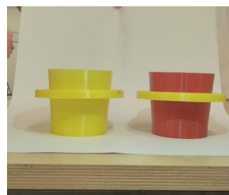
Fig. 1. The first 3D-printed prototype, which allowed us to understand we were after the wrong form

Ultimately, we identified five possible solutions of the idea we selected and we voted on them. We reached consensus on one (floating platforms), that was to be followed-up on with more research on its technical and economical feasibility. However, we realized that solution was not feasible (see Results section). In the meantime, partially repeating the steps of research and ideations phases, we arrived to a second solution, which we immediately started to prototype (see Results section). In this phase we applied the rapid changes and high adaptability that nonlinear innovation requires.