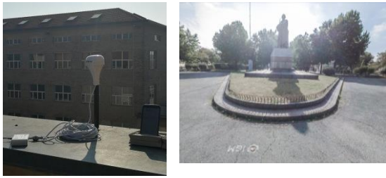
Figure 1: The two test sites: the place that represent the noisy environment (left, site A) and an undisturbed place (right, site C).

The second one is an undisturbed site, characterized by the absence of reflective surfaces, electromagnetic disturbances and with optimal conditions for tracking satellites (e.g. no obstructions). These two sites, namely A and C (Figure 1), respectively, represent the two main conditions where a user works or tries to perform positioning activities.