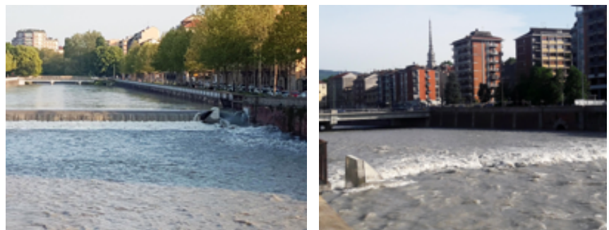
Figure 1: Location in the middle of the city of the mini-hydroelectric power plant. In this photos the system is completed and on the right side we can see the fish ladder.

Considering the purpose to preserve river ecosystem, the project has planned to establish a fish ladder in vertical slot to facilitate fishes' natural migration. It is also designed to reduce the environmental impact on landscape, local vegetation and urban noise. We need to apply systems thinking for providing benefits for humans and at the same time preserving ecosystems and enhancing historical pre-industrial heritage. Managing local resources and providing benefits for the whole context is important to promote sustainable urban metabolism, through the application of the holistic viewpoint. Urban context and natural river ecosystem are complex systems and design in-for-with them is a practice to undertake in a systemic view. Finally this paper's purpose is to show how systems thinking and ecological principles can be applied to face one of the most important challenge of our time: produce clean and sustainable energy in site and reduce its ecological footprint.