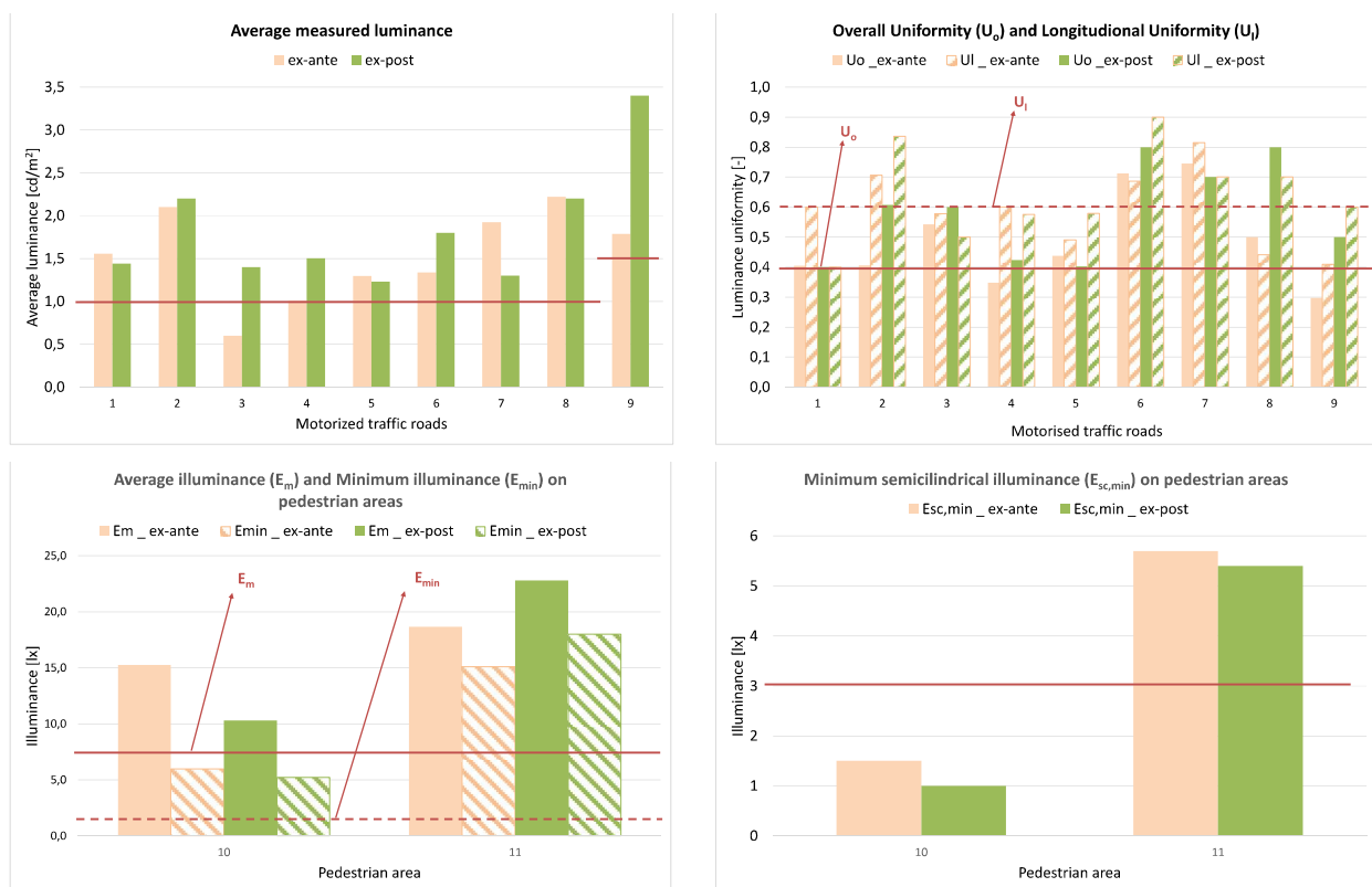
Figure 2. – Lighting performance of the ex-ante and ex-post installations for the motorized traffic roads and the pedestrian areas.

In Fig. 2 the lighting performance of the ex-ante and ex-post installations are compared. The red lines in the graphs correspond to the performance required according to the standards.