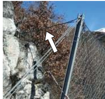
Fig. 2 - Short upstream rope