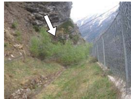
Fig. 3 - Long upstream ropes