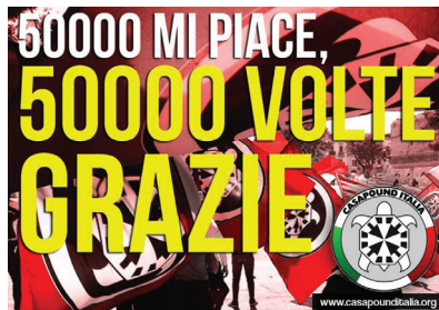
Fig. 4 – CasaPound Poster: Acknowledge for Facebook Likes

prevents the viewing of the video, nor hinders the political message it conveys. The juxtaposition, this term seems fitting, of the banner on the video of CasaPound, however, shows a clear complex entanglement between political phenomena, political categories, and media processes, especially if one takes into account the good fortune and the meaning that the concept of extremism has enjoyed and continues to enjoy in global scenarios. Is it therefore still possible to evoke the concept of extremism when describing political phenomena of this kind? That's hard to say. Certainly, the Internet's modes of communication, and in particular those of social networks which shape the language of extremism, produce major changes between the latter and the rest of society. This does not mean that the subversive potential and anti-democratic policies of these formations has failed. It simply must be observed, especially for the purpose of a theoretical advance in media studies and the phenomena related to them, as the historical evolution of a concept (extremism) is unaffected by the changing medium through which it is expressed.