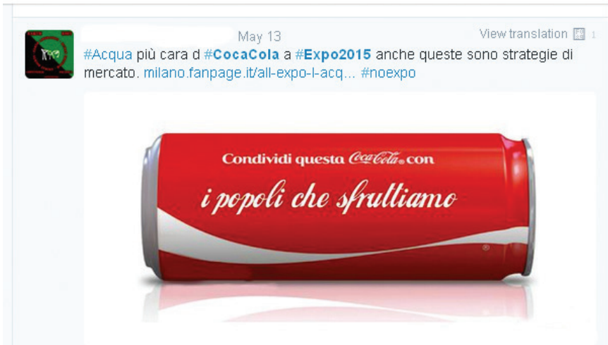
Fig. 1 – Reappropriation of a Coca-Cola can 6