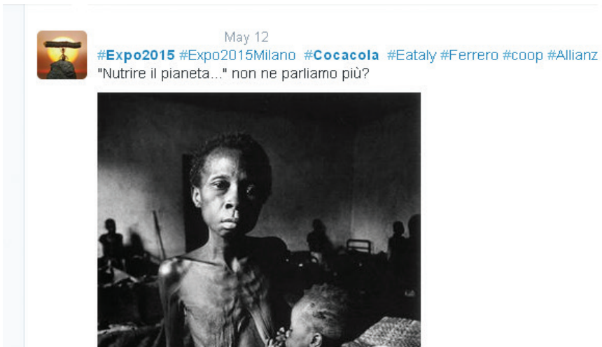
Fig. 2 – Inconsistency between Expo value proposition and sponsors 7