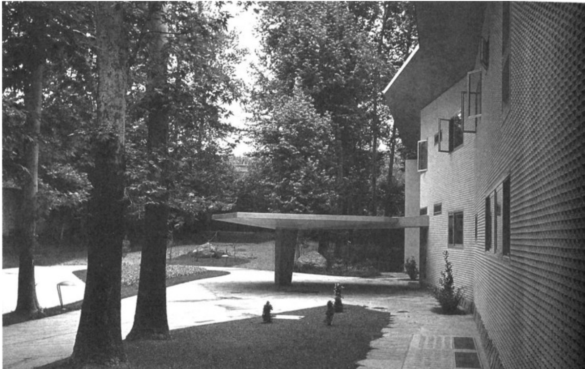
Facade of the Villa Namazee. © Gio Ponti Archive.