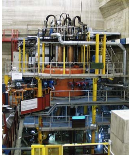
Fig.2: A view of K800 Superconducting Cyclotron at Laboratori Nazionali del Sud in Catania.

The present limit of low beam current we have experienced both for the CS accelerator and for the MAGNEX focal plane detector must be sensibly overcome. For a systematic study of the many “hot” cases of \beta\beta decays an upgraded set-up, able to work with two orders of magnitude more current than the present, is thus necessary. This goal can be achieved by a substantial change in the technologies used in the beam extraction and in the detection of the ejectiles. For the accelerator the use of a stripper induced extraction is an adequate choice. However, with the present set-up it is difficult to suitably extend this research to the “hot” cases, where \beta\beta decay studies are and will be concentrated. For the spectrometer the main foreseen upgrades are: