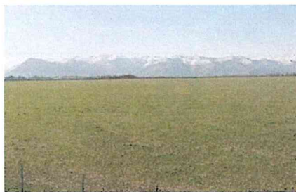
Scenario without intervention

The CV question was offered according to the “open format” and the payment vehicle was represented by a one-off payment in the form of an income tax.