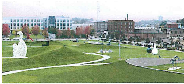
Scenario with intervention