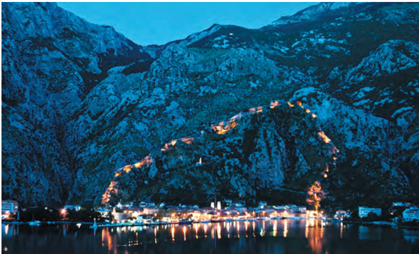
Figure 2: The illuminated walls of Kotor seen from the bay.

Along the wall many bastions and ramparts are present to allow a constant monitoring of the surrounding area. Ramparts and platforms for artillery are connected to each other