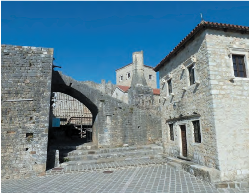
Figure 6: The Cittadella area in Ulcinj.

Today all this area is the city's museum. The church, founded in 1510, in the north area, converted into a mosque by the Ottomans, without changing the typically Venetian characters, contains within it different typical heirlooms: badges, everyday objects, historical maps, decorative elements, jewellery, decorations, etc.