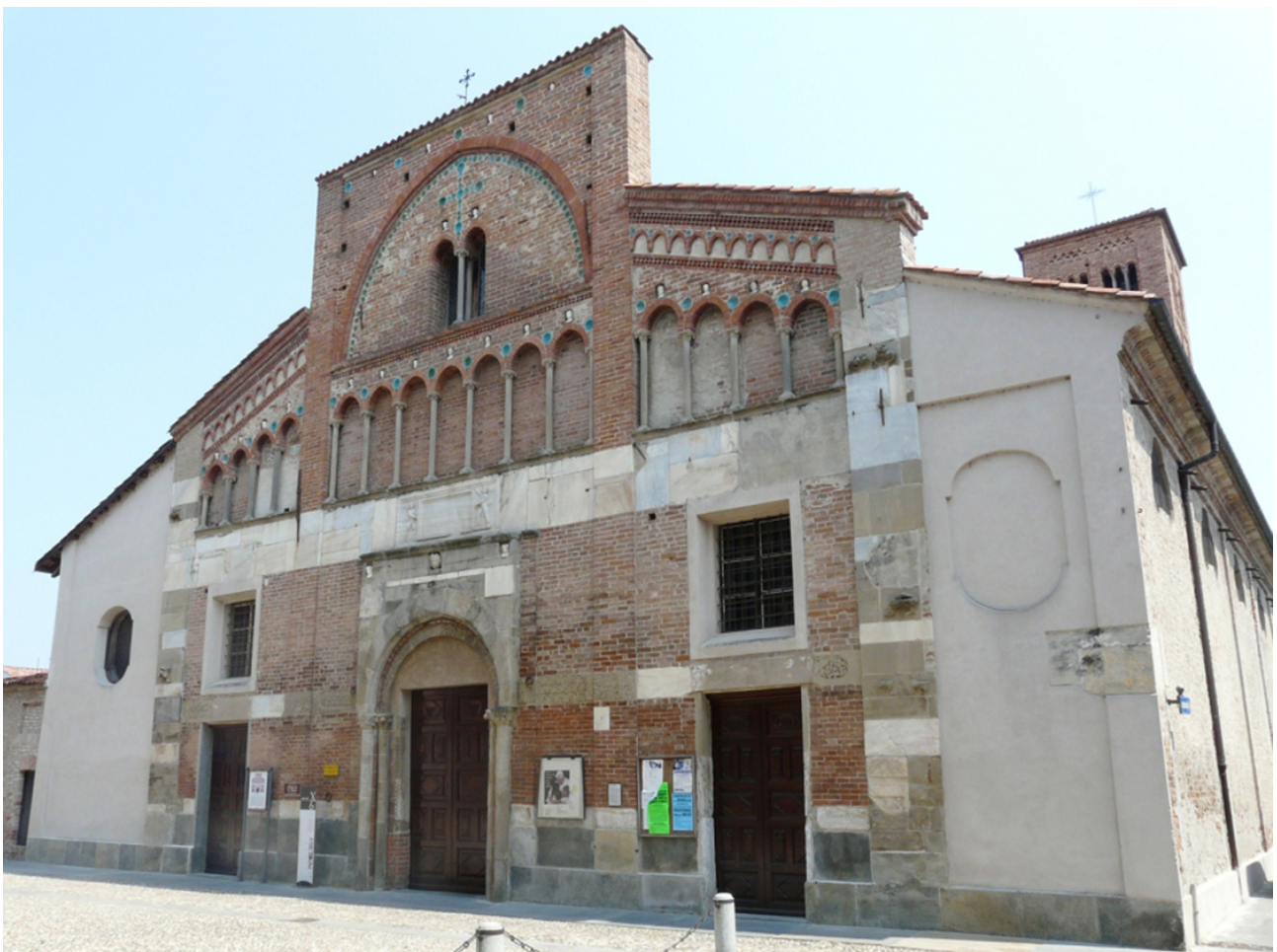
Fig. 2 Facade of St. Peter's Church, Cherasco. ( http://archeocarta.org ).