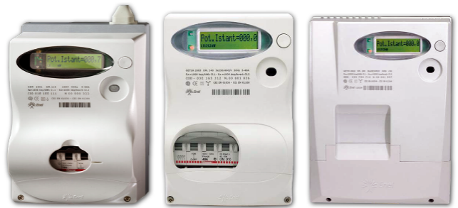
Figure 4. Smart meters used for Telegestore – from left to right: single phase (GISM), poly phase meter for demand up to 30 kW (GIST), poly phase meter with current transformer (CT) for demand up to 200 kW (GISS).

core and metrology functions. STCOMET simplifies the design