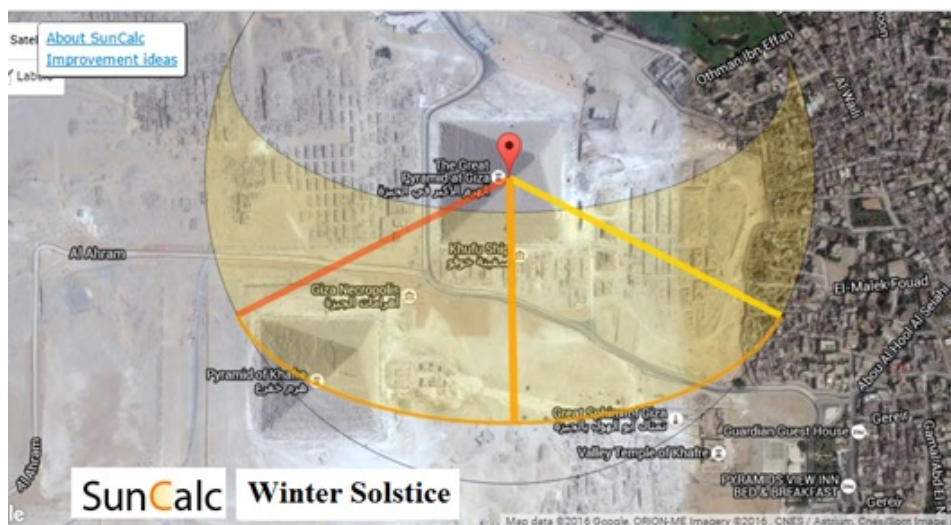
Figure 1: Using SunCalc we can find that Khufu can see the point of the horizon where the sun is setting on the winter solstice, and then he can see the same on all the days of the year. This happens because Khafre's architects have considered a proper place for the new pyramid. No problems for sunrise, because horizon is free.

The second pyramid that had been built was that of Khafre. In fact, Khafre had probably the same desire to admire sunrise and sunset from its pyramid. But its horizon was not free because constrained by his father's pyramid. It is probable that Khafre's architects decided the position of the new pyramid, in order that the king could see the points of the horizon where the sun was rising and setting thorough the year, maintaining the same possibility for Khufu. And in fact, if we use SunCalc (see Figure 1), we can see that Khufu sees the point of the horizon where the sun is setting on the Winter Solstice and therefore he can see the same on each days of the year. This happens because Khafre's architects have considered a proper place for the new pyramid. No problems for sunrise, because horizon is free. Of course, the Khafre's architects have considered that their king would like to observe the sunrise on each day of the year. Using SunCalc (see Figure 2) we can find that Khafre can see the point of the horizon where the sun is rising on the summer solstice, and then he can see the same on each day of the year. No problems for sunset, because horizon was free.