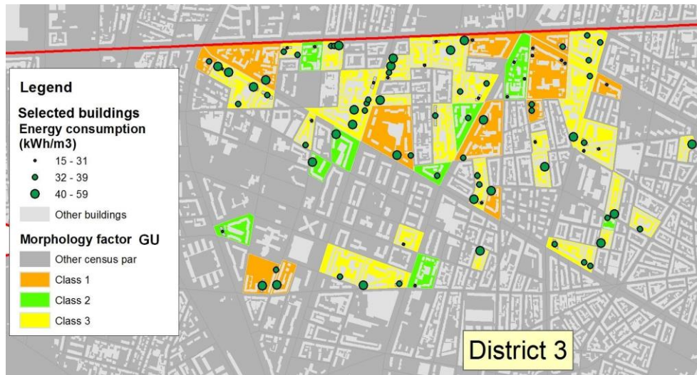
Figure 2. The energy-use for residential space heating and the urban Morphology classes

In Fig. 2 the map of the energy-use for space heating for the sample of the residential buildings in district 3 in the city of Turin is represented.