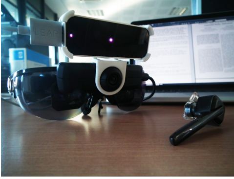
Fig. 2. Leap Motion Controller, Vuzix AR Glasses and Plantronic Headset

dictionary. Although in some cases convenient, continuous speech recognition has the drawback of generating a lot of false positive detections in noisy environments. As a solution, the present paper proposes to tie it to a specific gesture, in order to de/activate it at will. The interface features a few, key vocal commands, in order not to force the user to remember too many words and to improve the recognition rate. Moreover, the commands are context-dependent, in order to minimize the number of false positives .