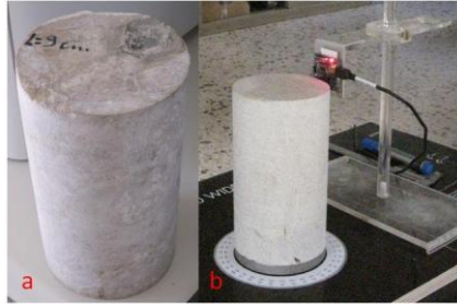
Figure 2: The physical model of a limestone statue “restored arm” with the iron pin fitted inside (a). The system, with the vertical sliding arm and the rotating platform, made to realize the cylindrical scanning of the model (b).