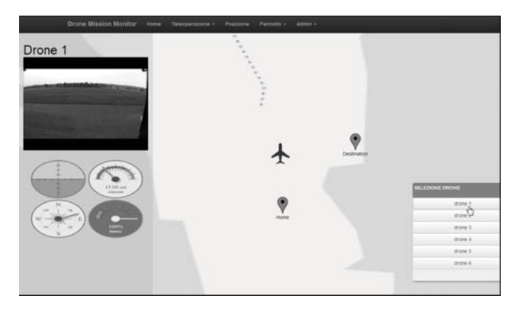
Fig. 2. Web browser GUI

distance for mission accomplishment are also made available. In addition, the video streaming from the UAV camera can offer assistance to the person in emergency.