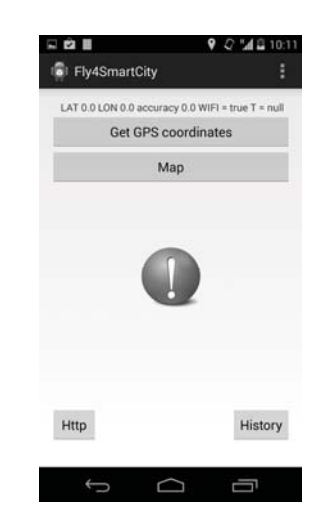
Fig. 1. Android application

The first interface is a mobile application running on an Android smartphone. It acquires GPS coordinates and phone ID when the user request for help. Then it sends these data (GPS coordinates and phone ID), over HTTP protocol, through a GET request to the server of the cloud platform. An example of the GET request could be: http:/ffsc/request/?gps=45.674524,7.398732&cell=32308937642&command=takeoff