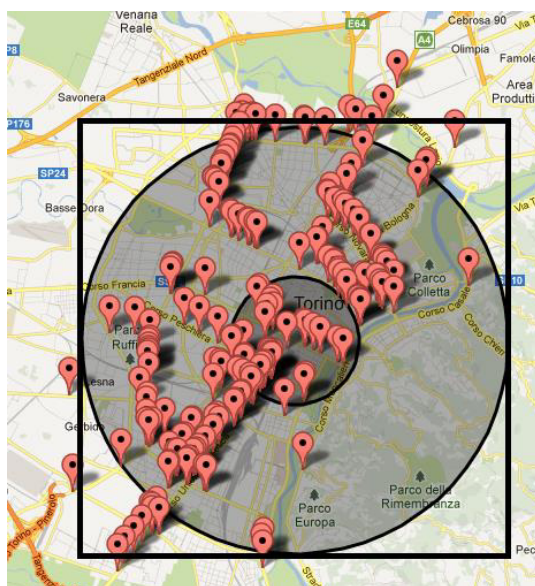
Fig. 1. Distribution of the speed sensors of Turin, where the grey circle represents the urban area used in this study.