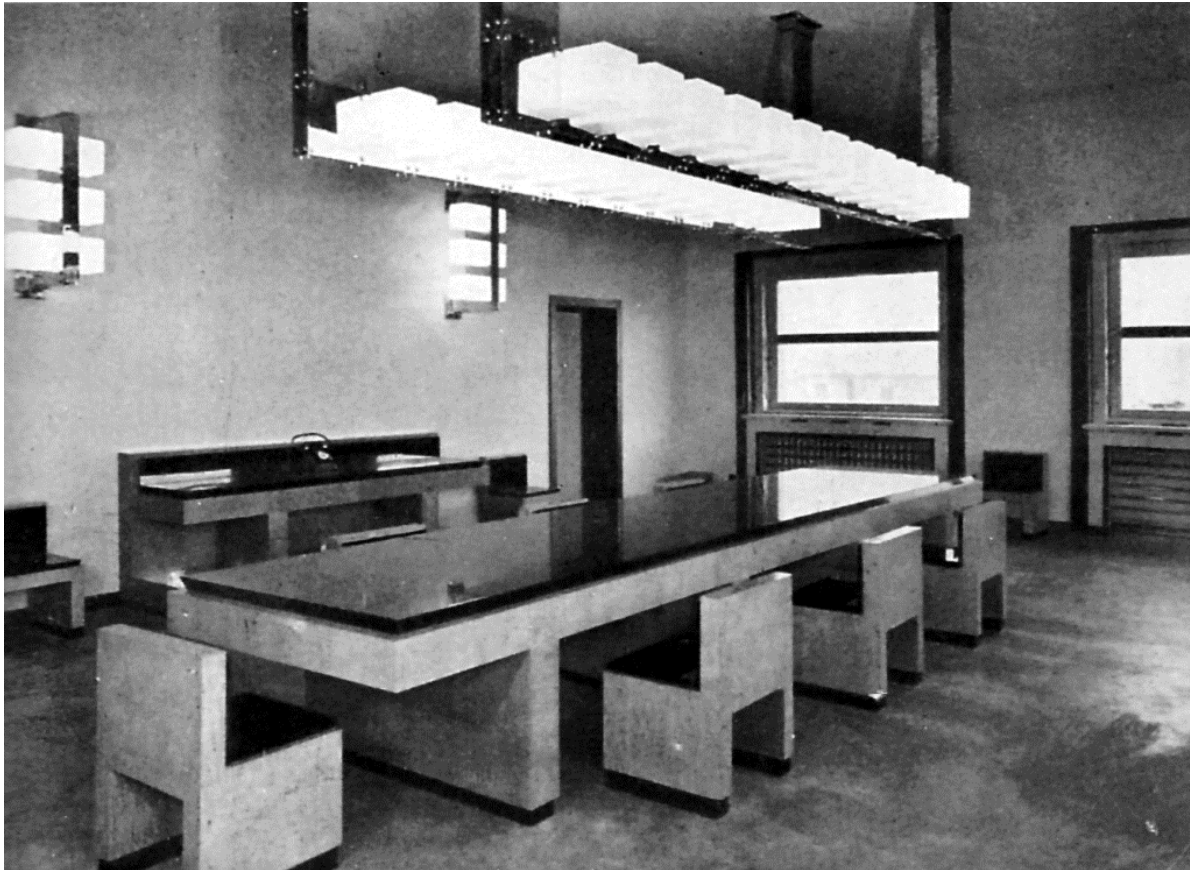
Fig. 4. Boardroom with Salpa leather floor, lamps using Artax cubes and F.I.P.'s furniture in grey and black buxus. Domus , n. 30 (1930), p. 66.

The building looked like a great “body” in the service of a great industry. «Light signals, ringtones, phones accelerate the work, organizing activities, the possibilities multiply in perfect step with the fastest machines of the big industry that feeds these offices» 15 .