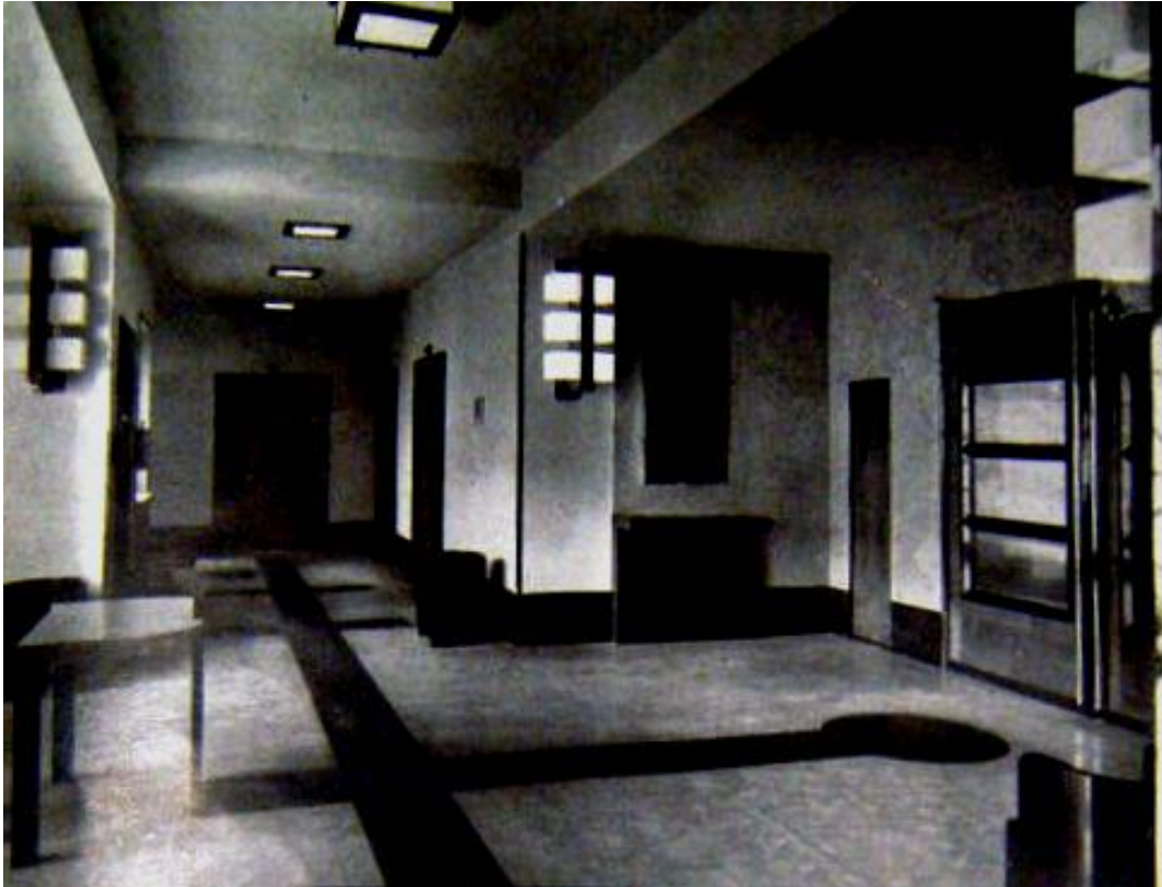
Fig. 2. Entrance hall comprising office boy's table. La Casa bella , n.32 (1930), p. 17.

Inside the building, the wall edges were covered with chrome profiles, which reduced wear and at the same time made the light vibrating (Fig. 2). Every detail, from wall clocks to handles, was designed to improve work and receive clients.