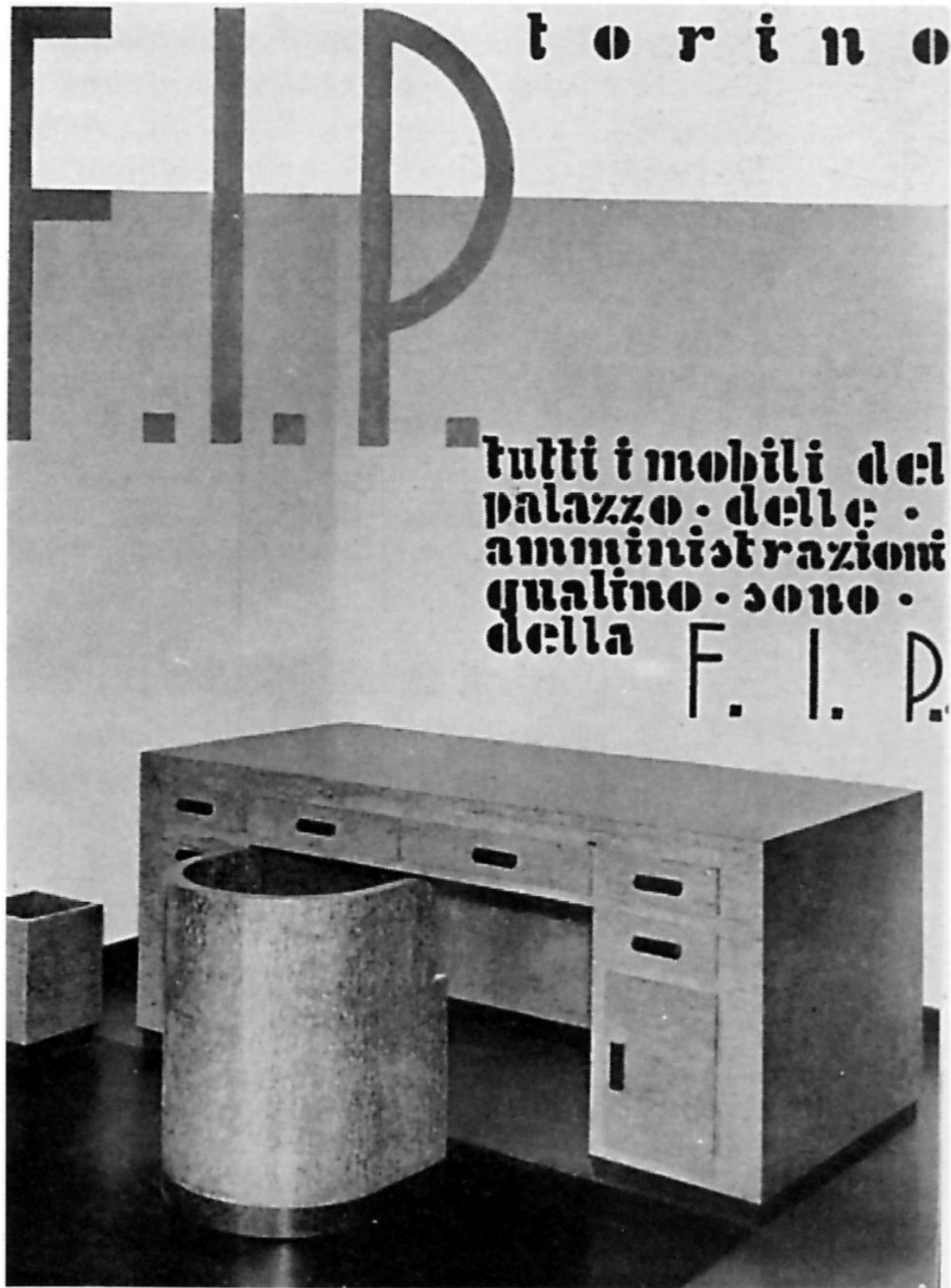
Fig. 5. F.I.P. advertisement. Domus , n. 30 (1930), sp.

Furniture was composed of pure volumes made shiny by the combination of different buxus veneers (Fig. 6). The new material was produced by the Cartiere Giacomo Bosso and worked by F.I.P. in Turin 16 .