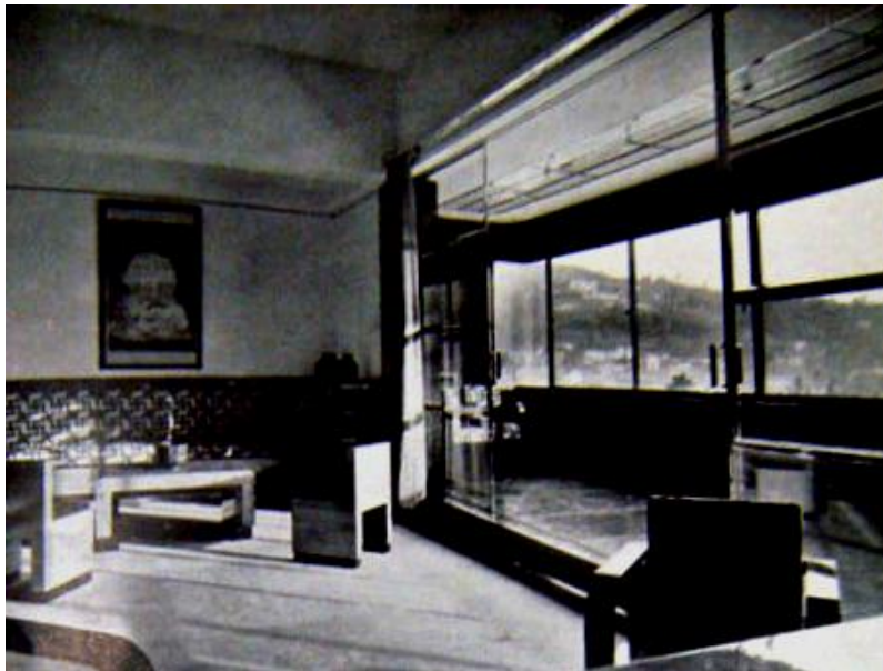
Fig. 7. The president's office. La Casa bella , n.32 (1930), p. 16.

Gualino's office was at the top of the building (Fig. 7). In Domus the painter Gigi Chessa published an enthusiastic comment on this interior design: «Isolated on the top floor, away from street noise, is the most refined and comfortable work environment [...]. But who can describe the beauty of the large window made of glass and chromed steel, and the veranda covered with shiny black?» 17 . In this space, the use of glass is symbolic: glass was the metaphor of moral transparency of the director and used as a medium of the corporate image (Fig. 8).