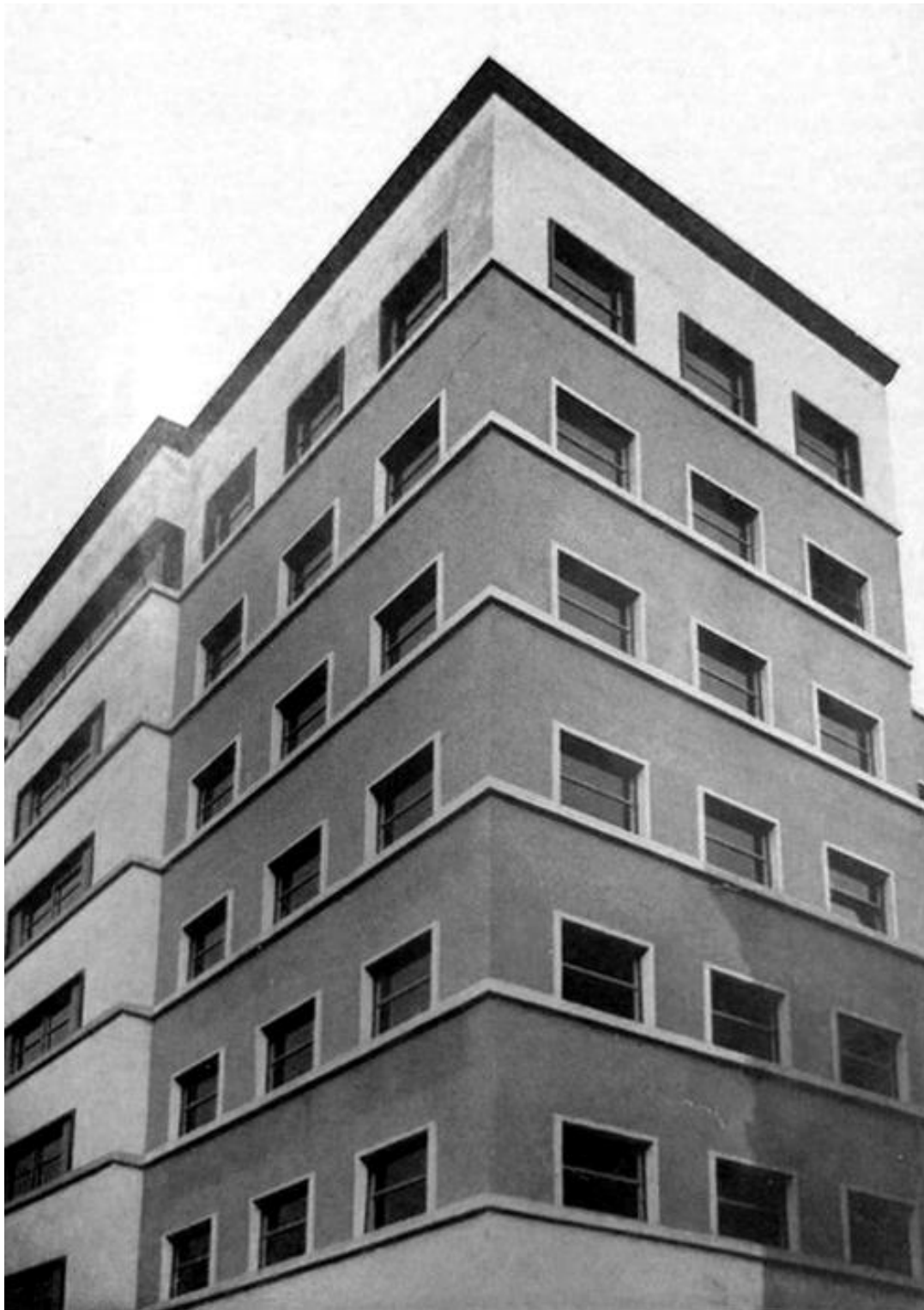
Fig. 1. Palazzo Salpa called Palazzo Gualino (Turin, 1928-1930). La Casa bella , n.32 (1930), p. 11.

Lamps were positioned around the openings to signal the entrance and, in the evening, the whole building became a dark background with no volume where the windows changed into large lamps. Furthermore, it was the result of a total work of art where every detail was conceived to be a part of a whole.