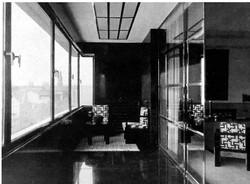
Fig. 8. Veranda of the president's office. La Casa bella , n.32 (1930), p. 21.