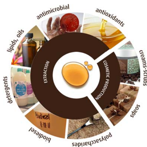
Figure 2 – Application fields of oils

SCG should be split into their two constituent elements (secondary raw materials): the oils and the exhausted coffee grounds, each of which finds different application sectors.