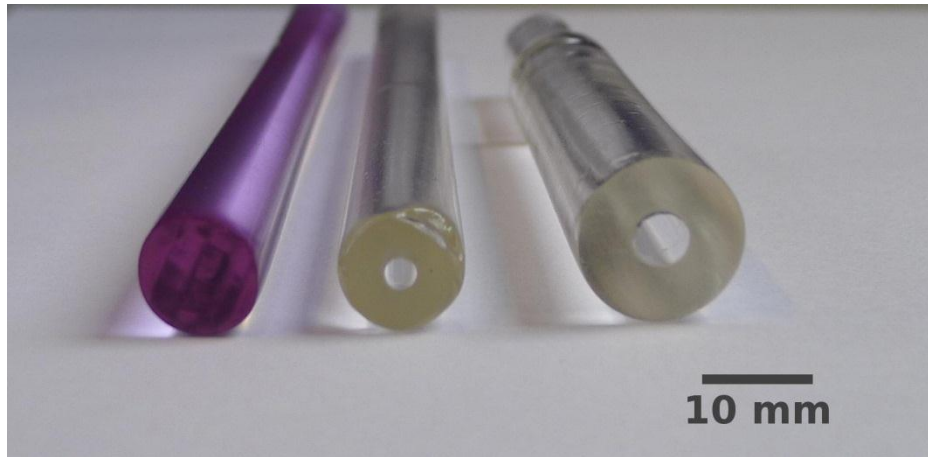
Figure 1: Glass elements of a phosphate glass preform. From left to right, core rod of Nd-doped phosphate glass, cladding tubes of passive phosphate glass

Typically the fibers reported here were drawn at a speed of 5 m/min and an onset furnace temperature of 630 °C.