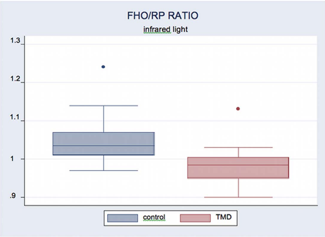
Figure 1. Box plot of FHO/RP ratio in infrared light condition. doi:10.1371/journal.pone.0045424.g001