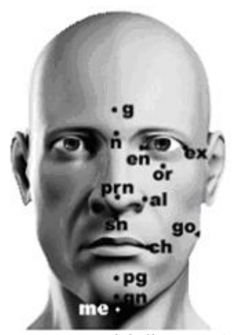
Figure 1. Anthropometric soft-tissue landmarks: g-glabella, n-nasion, en-endocanthion, ex-exocanthion, ororbital, prn-pronasal, sn-subnasal, al-alae, ch-cheilion, pg-pogonion, gn-gnathion, go-gonion, me-menton (Calignano, 2009).

One of the most important application that deal with facial landmarks is face recognition , whose large applications are: citizenship identification in borders, passports, I.D. documents, Visas; criminal identification in database screening, surveillance, alert, mob control and anti-terrorism; corporate usages in access control and time attendance in luxurious buildings, sensitive offices, airports, pharmaceutical factories; utility laptop, desktop, web, airport/sensitive console log-on and file encrypt; on line banking; gaming in casinos and watch-lists; hospitality industries such as hotel and resort CRM's; important sites like power plants and military installations. The purposes are various, but belong to two big branches: face verification, or authentication, to guarantee secure access, and face identification, or recognition of suspects, dangerous individuals and public enemies by Police, FBI and other safety organizations (Jain et al. , 2005).