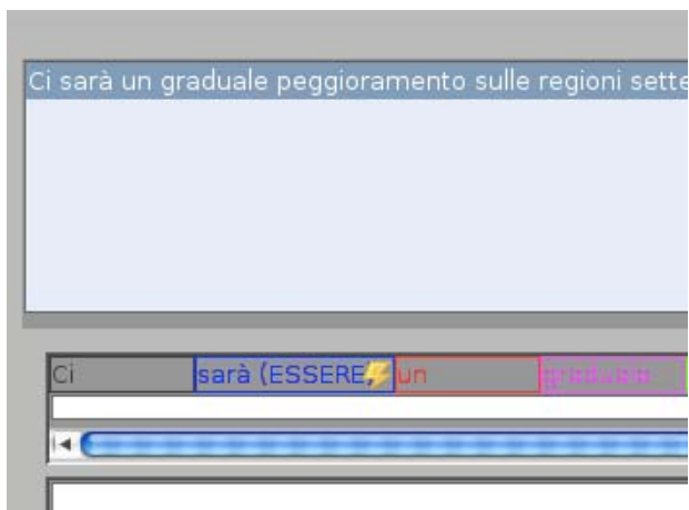
Figure 2. Main Window

For each sentence ALEA retrieves information from these modules and gives the user the possibility to perform some important operations such as word shifting, word syntactical role specification and disambiguation of lemmas. Figure 2 shows a portion of the main window in which it is possible to perform these operations.