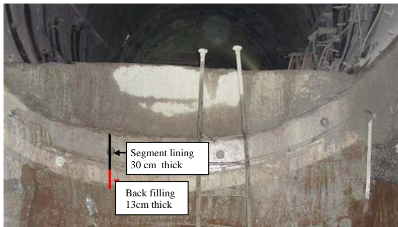
Figure 2 – Example of backfilling in a metro tunnel in Italy

In an Italian subway station excavation we can see, when the “dummy” segments have been removed, the presence of the “annulus” filled with the gel. The following picture allow us to see the presence of the back-fill under the invert segments (Fig. 2) that proves the complete filling of the voids.