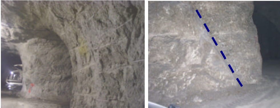
Figure 4. On the left, a room and pillar mine, excavated by blasting. On the right, a main transversal joint in a pillar.

Due to its geo-structural setting and hydrological features, gypsum exploitation has been frequently responsible of environmental and safety problems connected to the quarry face and drift stability and surface subsidence hazard. Stratigraphical or structural marly layers, active karst circuits and abandoned karst voids refilled of water or terrigenous deposits are main critical aspects to pay attention in planning and management of quarrying activity.