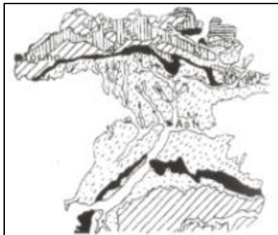
Figure 1. Geological sketch of the Tertiary Piedmont Basin; outcrops of the Messinian formation are in black.

In Piedmont, main exploited gypsum bodies belong to the Messinian “Formazione Gessoso Solfifera” (named “Complesso Caotico di Valle Versa”; Dela Pierre et al. , 2003) that are located along two large belts (from a few hundred meters to two kilometers width), bounding to the N and S the Tertiary Piedmont Basin. The north belt runs in a discontinuous manner for 35 kilometers, from Moncucco to Ottiglio (Monferrato domain), while the south belt (Langhe domain) runs for almost 25 km crossing the whole central area of Piedmont from W to E (Fig. 1).