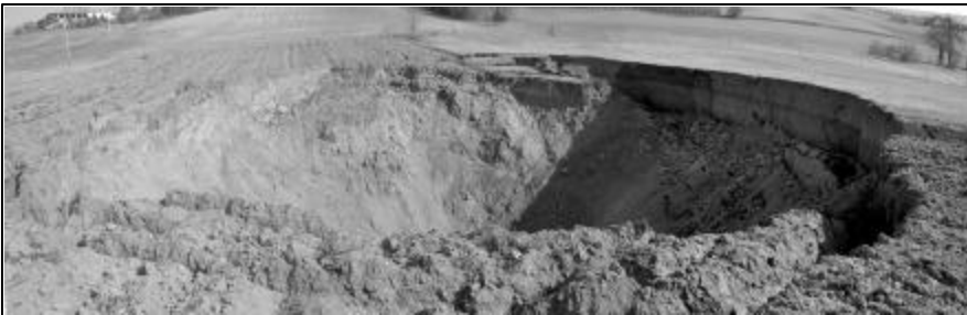
Figure 3. Sinkhole developed in the gypsum quarry area of Moncalvo (Asti).

Because of the high solubility, one of the main problems in gypsum exploitation is represented by active karst or presence of abandoned karst voids refilled by residual deposits (usually clay and marls). Gypsum karst has a considerable influence on quarrying activities, as well as quarrying activities can produce strong impact on gypsum karst, particularly when changes in groundwater circulation are induced and quarry interferes with the local hydrogeological setting. Without a steady geo-survey and a correct quarrying management, exploitation activity can be responsible for dangerous water inrushes, impoverishment of natural water resources, lowering of the water table in communicating surface aquifers, increase in water flow velocity and gypsum dissolution rate, collapses and drawdown cones extension. Gravitational breakdowns can initially develop in the karst unit and, in some cases, successively propagate upward through the overlying beds, reaching the surface and producing subsidence phenomena (Fig.3).