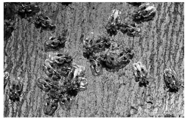
Fig. 1. Adult specimens of Corythuca ciliata.

In August 2011 a 23 year old man and 18 year old woman residing in the ASL CN1 Health Services Offices territory presented at the emergency department of the local hospital after having developed a rash during the previous night on the hands, neck and head which was