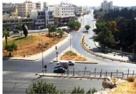
Figure 2: Examples of Hazardous Locations at Al-Madina Al-Monawarah Street