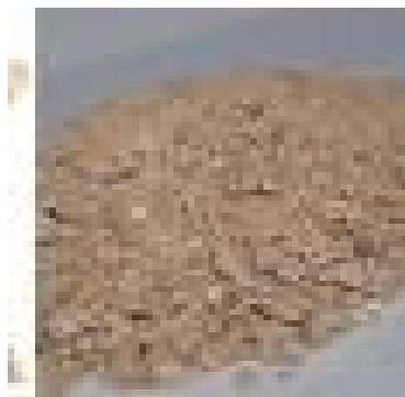
FIG. 2 Pulverized Irvingia gabonensis seeds