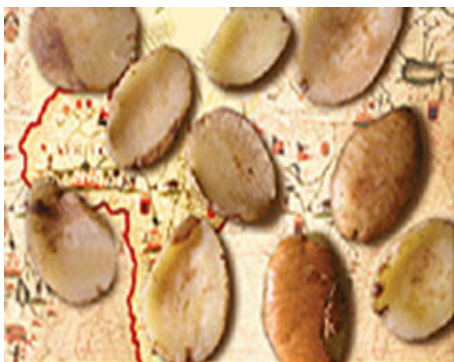
FIG. 1 Irvingia gabonensis seeds