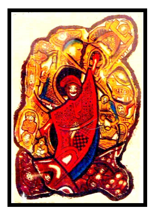
Plate 8: Joy of Doing Good Etching Print on paper (42x30cm) Segun Adeku (1999)