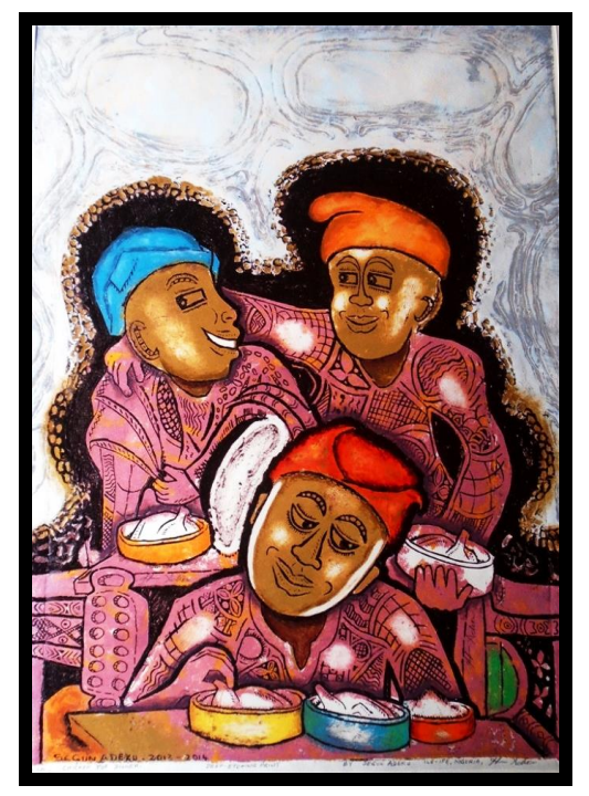
Plate 5: Chicken for Dinner Deep Etching Print on Paper (46 x 62cm) Segun Adeku (2014)