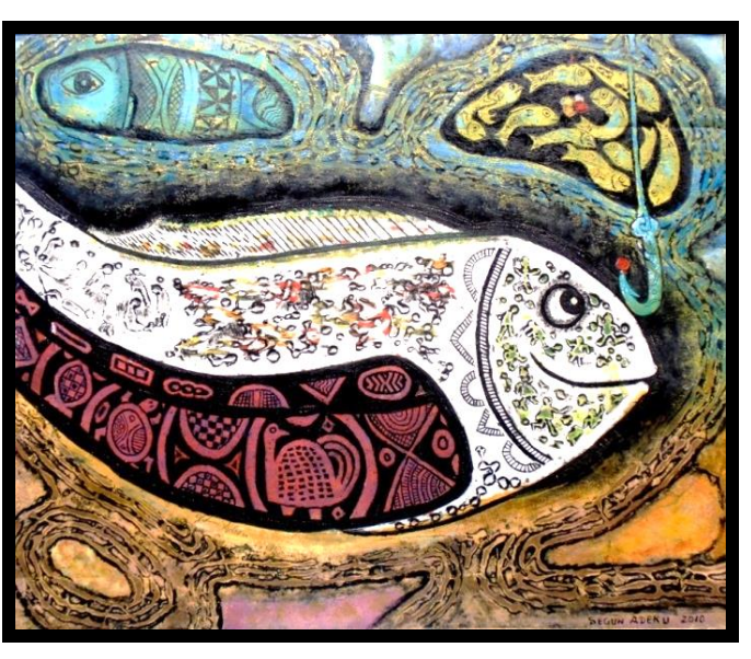
Plate 7: The Lecturer Deep Etching Print (41 x 51cm) Segun Adeku (2010)