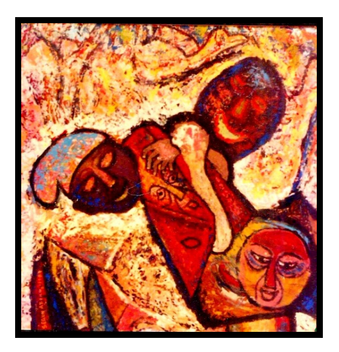
Plate 9: Plane of Feeling Oil Painting on Board (56x61cm) Segun Adeku (1998)

The spatial analysis of Adeku's picture planes shows that his approach is generally devoid of traces of formal (scholastic) treatment or easel painting traditions such as perspective, foreshortening, organization of the pictorial surface and the use of colour theories and principles. While displaying the character of 21st century artists, it is difficult to pin him down to a particular art movement: he experiments with his 'loved-medium' deep etching print; he invents new forms and reconstructs reality from his own private experience. Flat surfaces are delicately embellished with decorations, using warm and bright colours.