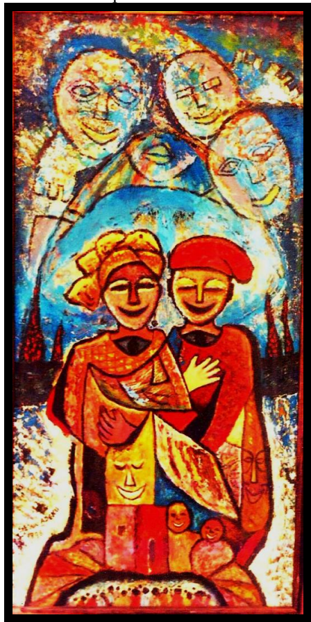
Plate 2: Manageable Few Oil Painting on Board (90 x 60cm) Segun Adeku (1999)