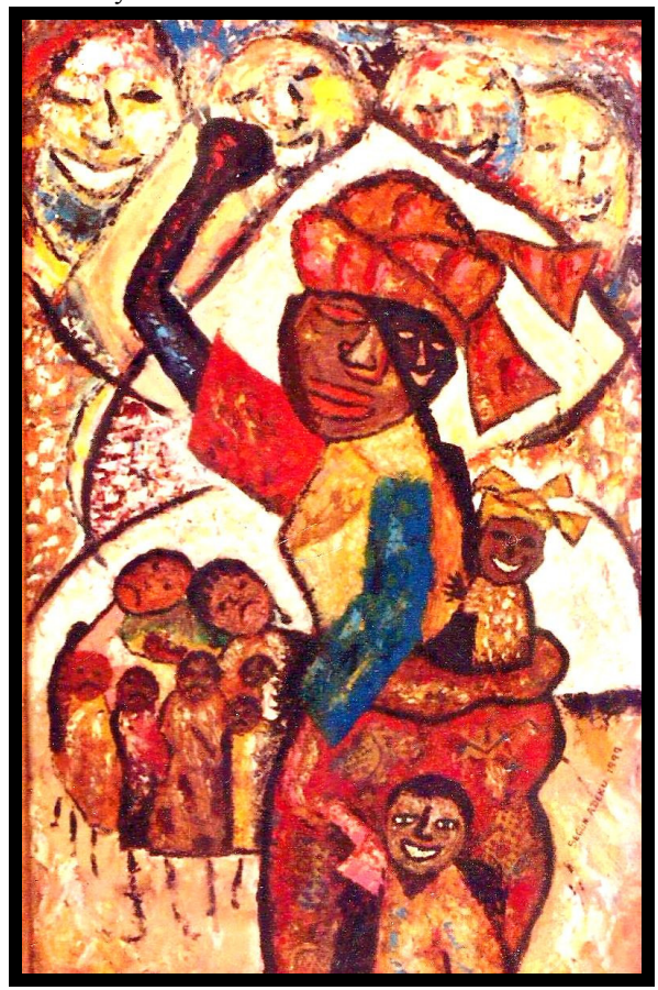
Plate 3: Harmony Oil Painting on Board (240 x 60cm) Segun Adeku (1998)