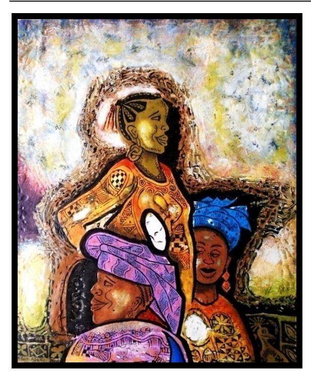
Plate 4: Beautiful Ladies Deep Etching Print on Paper (41 x 51cm) Segun Adeku (2010)