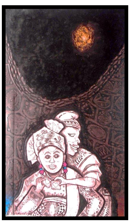
Plate 6: Card of Love Deep Etching Print on Paper (31 x 51cm) Segun Adeku (2011)