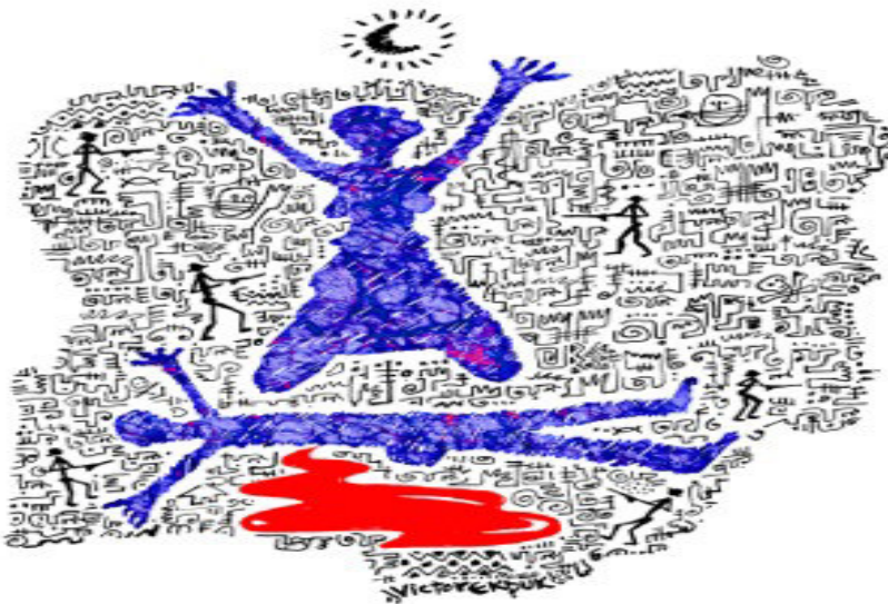
Plate: 2 Title: Wailing Woman Artist: Victor Ekpuk Medium: Computer Year: 2009

the Nsibidi to create 'wailing woman', a painting generated with the computer in Plate 2.