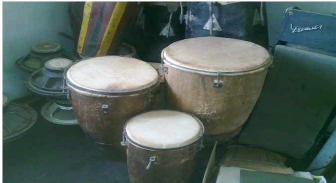
Fig 2: Akuba