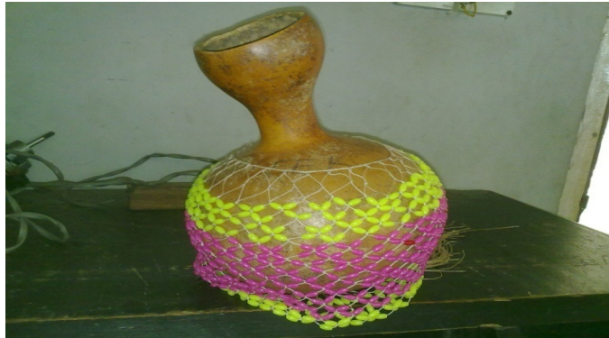
Fig 1: Sekere