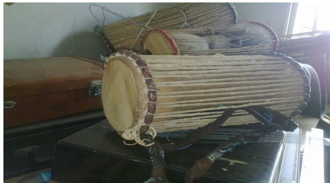
Fig 3: Gangan