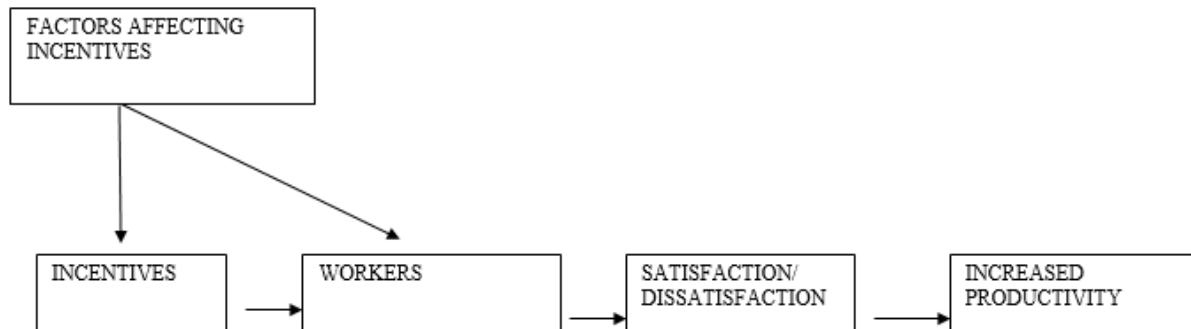
Figure 2: Adopted Incentives- Productivity Chain. Source; Aina, (2010)

However, in spite of the contributions of these studies to the understanding of the relationship between construction workers and their motivation needs, these researches are silent on the intra and extra industry factors that affect the health of the incentives schemes and their performance. Against this background, a concept that includes the input of the factors affecting the incentives in the motivation chain was developed, this concept shows that these influencing factors impinge on the incentives directly and indirectly affect other elements on the motivation chain. See Figure 2.