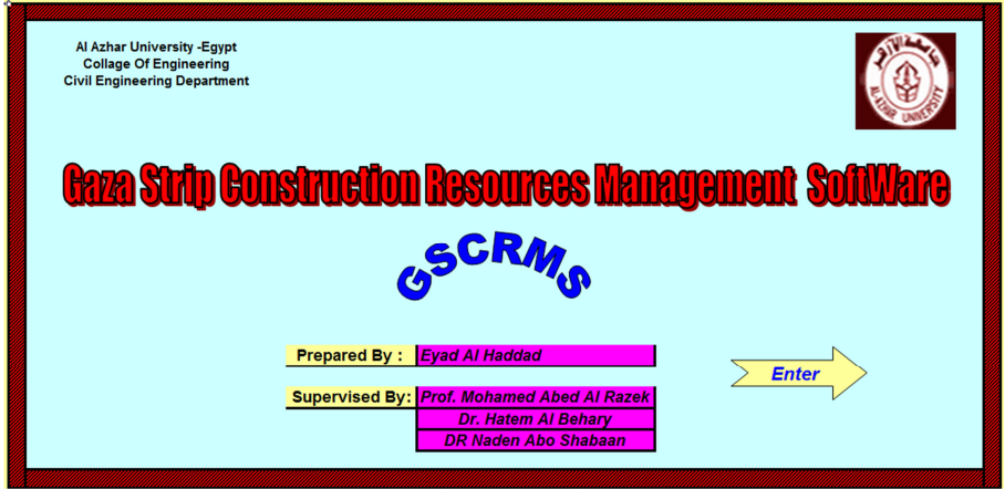
Figure 1: Start sheet

Figure 1 illustrates the start sheet. It provides a summarized identification of the software. The user can open the main menu sheet by clicking on " Enter " icon of the bottom at this sheet.