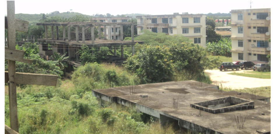
Fig. 6 Cape Coast Housing Project

The project had reached an advanced stage before being cut short. Successive governments and Inspector Generals of Police (IGP's) have blown hot air that they would complete such projects but everything has so far ended in smoke.