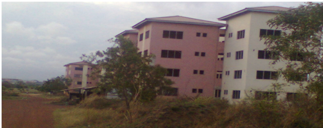
Fig. 3 Kpone Housing Project

Branching off to the right at the Kpone barrier on a barely one-kilometer stretch between the Tema Motorway Roundabout and Dawenya, lay a neatly tarred road, about a kilometer long, that leads directly to the Kpone Affordable Housing project site, a beckoning reality to reduce the housing deficit in the country. The project was a partnership between the Ghana government and a private company from the United States (Global Interest LLC) as well as a private Ghanaian company (known as Goshen International Company). The Ghana government had released 150 acres of land to construct 2,500 affordable housing units made up of one bed-room and two bed-rooms flats at Kpone, with the objective of selling them out to civil servants, teachers and nurses on mortgage basis (City Business Guide, 2010). Blocks that have been roofed are now providing shelter for some of the workers of the construction companies at the site. Some people from the Kpone Township are having a field day as they occupy parts of the flats with some of the buildings at 90% completion stage as indicated in fig 4.