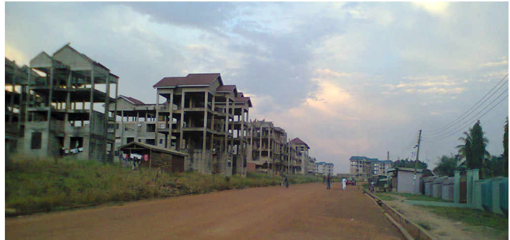
Fig. 1 Asokore Mampong Housing Project

The Affordable Housing Project was started in 2006 on a 50-acre plot at Asokore-Mampong in the Ashanti Region as in fig 1. The focus of the initiative was to provide decent and affordable houses at reasonable rates for public and civil servants who make up the middle class of the economy. Implementation of the project began with the construction of 800 flats of one, two and three bedrooms which was stalled in 2009 with some of the buildings at 90% completion stage as shown in fig 2.