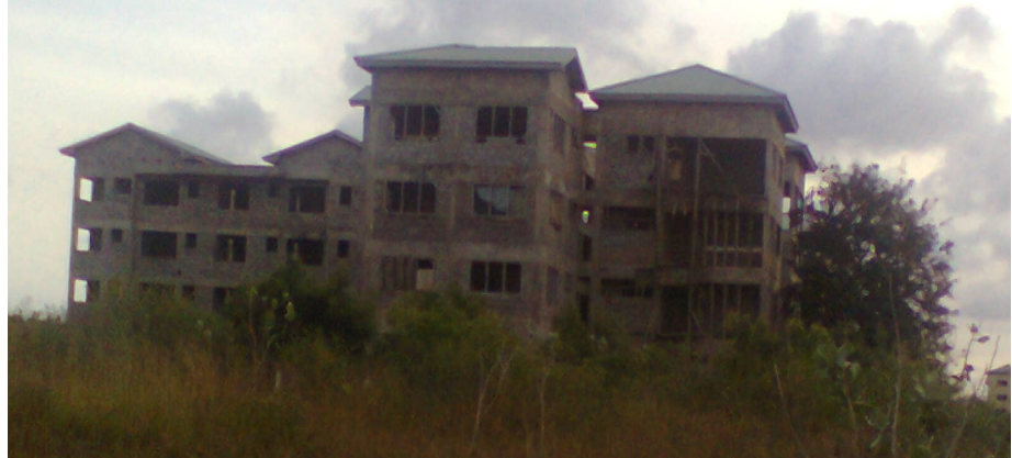
Fig. 7 Borteman Housing Project

The Borteman Housing Project, which was started in 2006 by the former administration (the Kufour-led Government) near Nungua in the Greater Accra region, has also been taken over by squatters. The project has been halted after the change in government with reports form the Ministry of Water resource Works and Housing that 16 out of the 79 contractors abandoned the project before the change. The focus was to provide houses at reasonable rates for Ghanaians with the objective of selling them out to civil servants, teachers and nurses on mortgage basis. Due to the very high housing deficit that the country faces, which was estimated to be between 500,000-700,000 in 2004, the government in 2006 instituted the affordable housing project which saw the construction of 800 housing units at Borteman in the Greater Accra region. The scheme was expected to be replicated in the other regions. However, the Sector Minister said he was optimistic that some of the projects would be completed before the end of the year 2006. This would pave way for President Agyekum Kufuor to inaugurate the programme he cherished most, Alhaji Abubakar Saddique explained that as at September 2006, the Borteman housing project was on course with some of the houses at roofing level while others had their electrical cables installed. The Borteman project together with those in Kpone and Kumasi are being funded at a total cost of over $300 million.