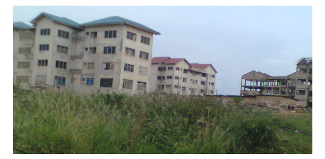
Fig. 2 Asokore Mampong Housing Project

Some of the houses are deteriorating at a fast rate as they have been left at the mercy of the weather. The Ministry of Water Resources, Works and Housing commissioned a diagnosis committee in 2010 to ascertain the root causes of the non-completion. Some of the findings of the committee were that the project was not handled properly as it was given to more than 400 contractors and the Ministry decided to purchase the materials for the contractors. The project was commenced with a 30 million dollar loan from the Social Security and National Insurance Trust (SSNIT) but the money got exhausted half way through. This raises some questions such as; was there a proper valuation to ascertain the cost of fully implementing the project?; Most of the materials on site such as iron rods, PVC pipes, sandcrete blocks, wooden doors, chippings, window and door frames have gone missing. According to the squatters, some foremen of the contractors working on the project, rented outs some of the rooms to people seeking accommodation.