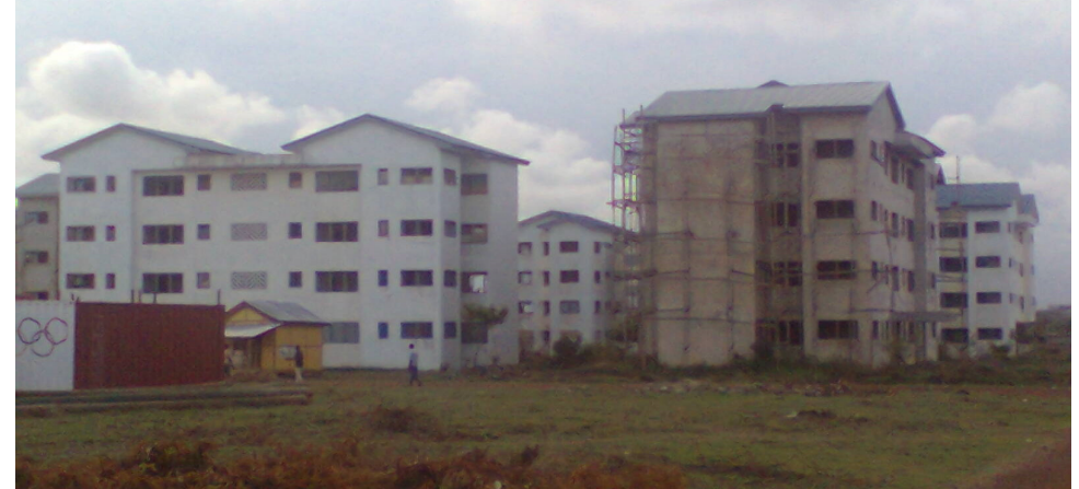
Fig. 4 Kpone Housing Project