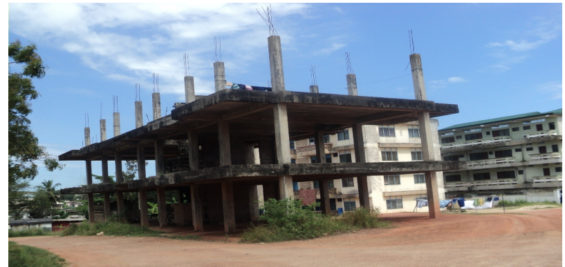
Fig. 5 Cape Coast Housing Project

4.3. Case 3: Cape Coast Police Housing Project