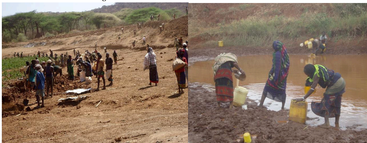
(a) Digging of shallow pond (dry season)