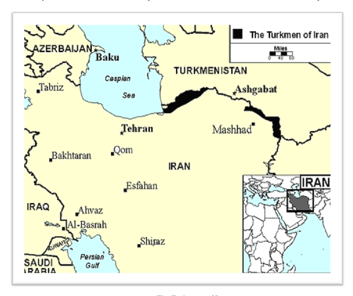
The Turkamen of Iran