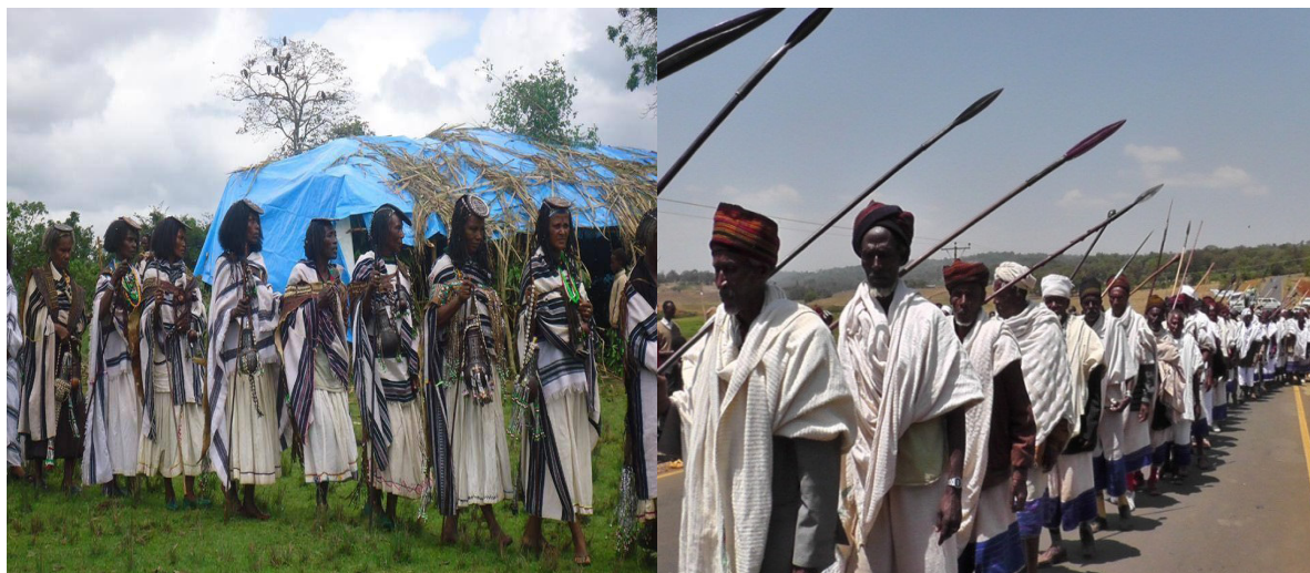
Fig 3: Both Gujii Oromo elder men and women marching to 74 th Gumii Bokkoo assembly

During the Gadaa power transfer, it is the women with the Siiqqee that blesses and decorates the ceremonies for the person who gives and takes over the Gadaa offices. Again, Ragatu quotes as ‘‘The newly elected officials walk under the Siiqqee sticks raised up by women standing in two rows and touching the other tips of their Siiqqee together’’ [31]. Thus, both Gadaa and Siiqqee institutions helped to maintain Safuu (Oromo moral codes) of Oromo society. It functions hand in hand with Gadaa system and it has given big opportunity for Oromo women to articulate their views and address issues of concerning to women [32]. Generally, in the Gadaa leadership, women are actively engaged through Siiqqee institution and they deal with all aspects of their life [33], [34].