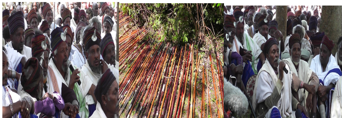
Fig 4: 74 th Gumii Assembly at Me'eeBokkoo

As Gujii elders narrate, the assembly takes five consecutive days before power transition. Each day, members of different Gadaa classes such as Gadaa , Doorii and Raabaa members of Uraagaa , Maattii and Hookkuu confederacy move in line to the center of meeting or ' Agaalla ' [40]. There are two travelling roots. The first leading segment belongs to the line of Gadaa members of the three confederacies orderly keeping their own line. The second segment is ' Doorii ' members of all three confederacies respectively and the third segment is ' Raabaa ' members of the three confederacies. During this Gumii traveling to the center of assembly various announcements are made, including travelling norms and other laws by the Yuubas . This speech continues up to the arrival of ' Gumii ' members to the ' Agaalla ' and formal discussion officially opened [41].