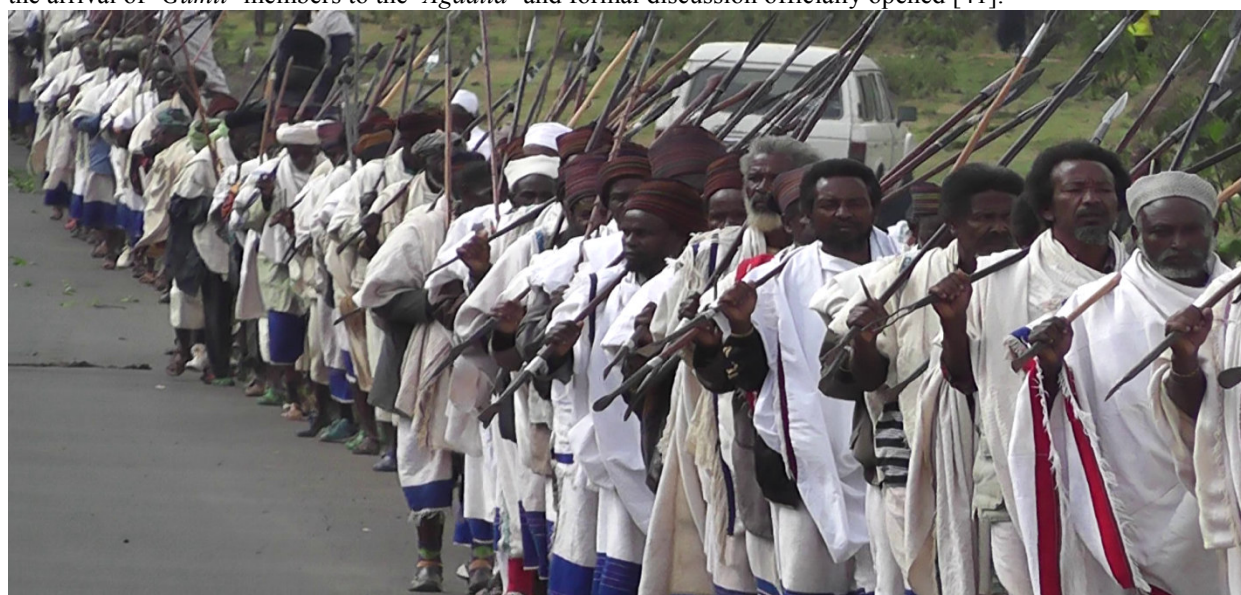
Picture 5: Gujii Oromo elders marching to Gumii Bokkoo during 74 th Baallii transfer from Dhallana to Harmuufa .

As Gujii elders narrate, the assembly takes five consecutive days before power transition. Each day, members of different Gadaa classes such as Gadaa , Doorii and Raabaa members of Uraagaa , Maattii and Hookkuu confederacy move in line to the center of meeting or ' Agaalla ' [40]. There are two travelling roots. The first leading segment belongs to the line of Gadaa members of the three confederacies orderly keeping their own line. The second segment is ' Doorii ' members of all three confederacies respectively and the third segment is ' Raabaa ' members of the three confederacies. During this Gumii traveling to the center of assembly various announcements are made, including travelling norms and other laws by the Yuubas . This speech continues up to the arrival of ' Gumii ' members to the ' Agaalla ' and formal discussion officially opened [41].