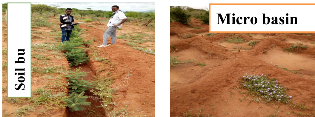
Figure 2. Soil bund and Micro basin in the study area