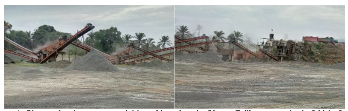
Figure 1: Picture showing quarry activities taking place in Okpoto-Ezillo quarry site in Ishielu Local Government Area of Ebonyi State.