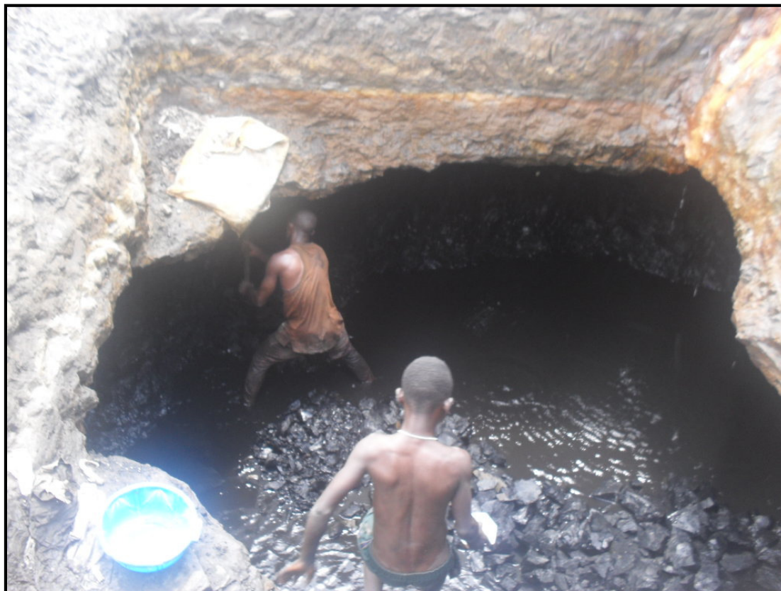
Fig. 3: Coal Mining face at Odagbo

Beneath the Mamu Formation is the Nkporo Shales. The Mamu Formation (Lower coal measures) consists of siltstones, mudstones, grey carbonaceous shales, sandstones and coal seams at several horizons (Ameh, 2013). The shales and mudstones are alternated with thin bands of siltstones. The Ajali Formation is made up of friable coarse grained sandstones and gravelly sands. Overlying the Ajali Formation is the red earthy sand; this was due to the effect of weathering and lateritization (Umeji, 2005).