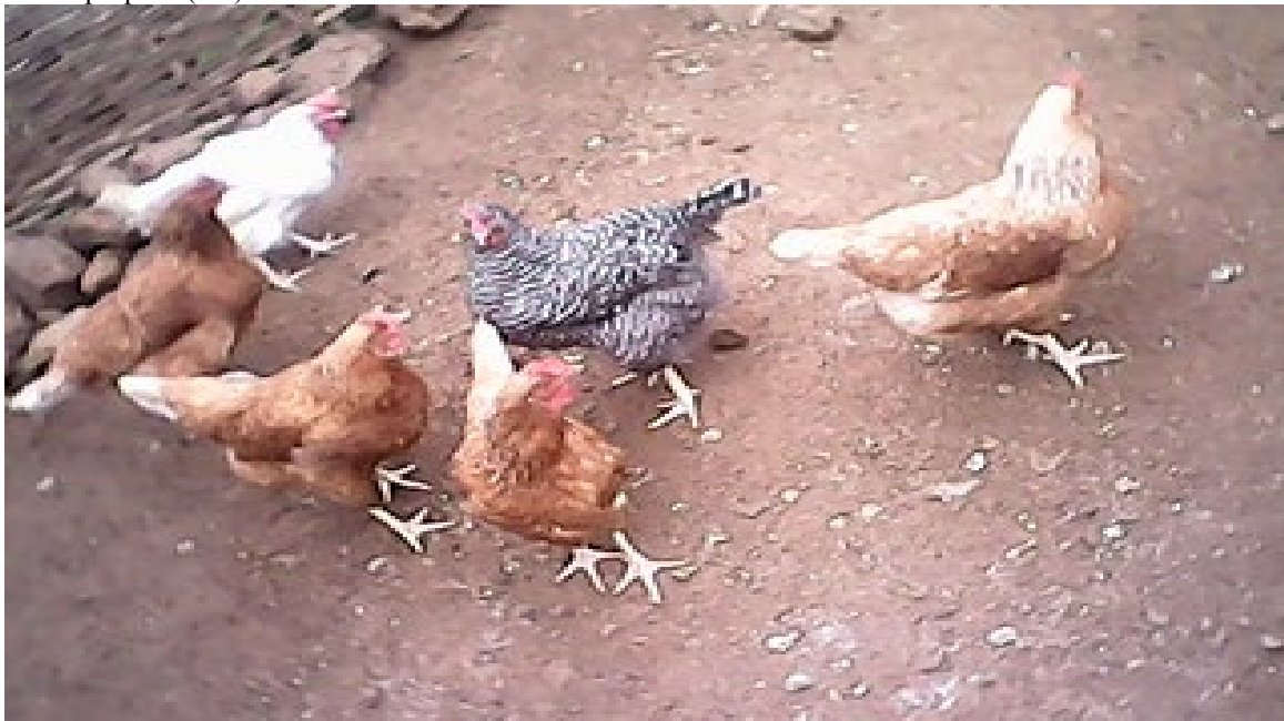
Figure 2. Bovans Brown, Bovans White (commercial layers) and Potchefstroom Koekoek (dual)

non-governmental organizations (NGOs) in Banja and Burie districts, which are commercial layers (BB and BW) and dual purpose (PK) breeds.