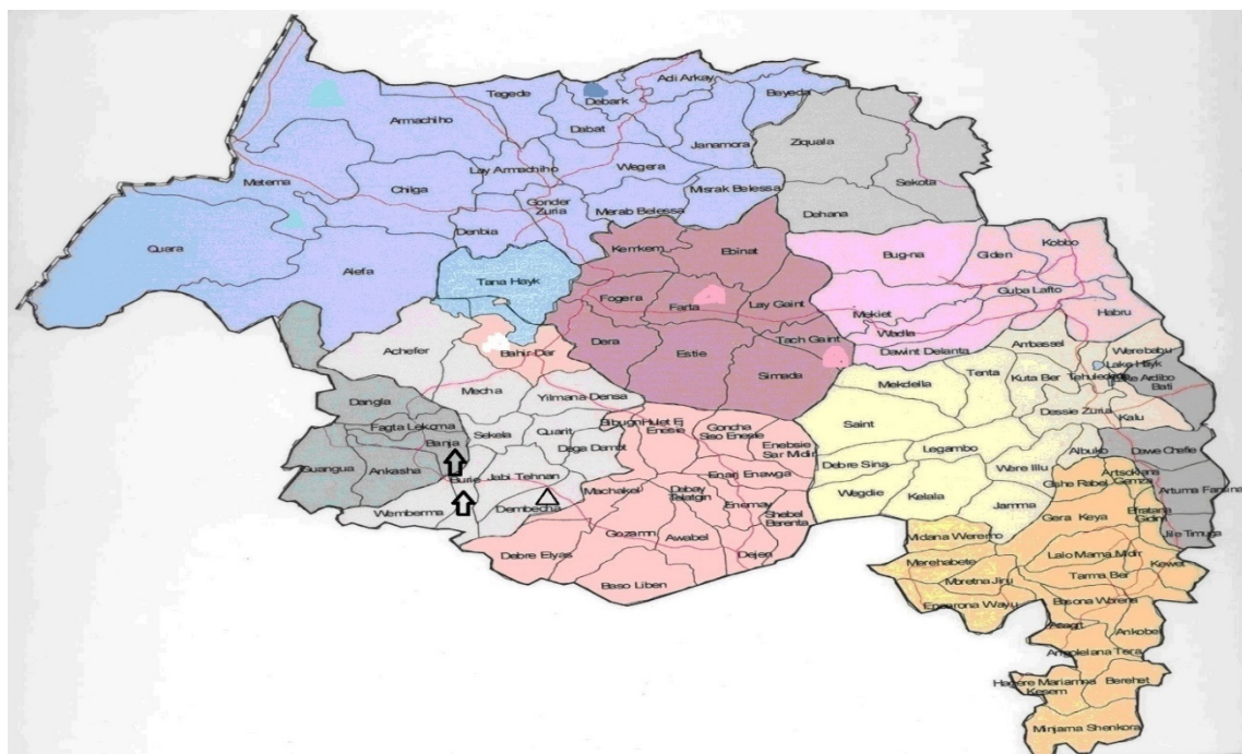
Figure 1 Map of the study districts are indicated by arrows