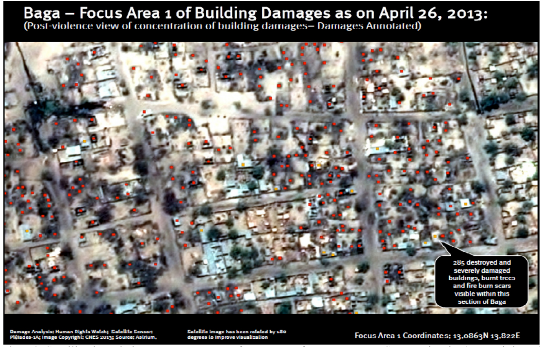
Plate 2 Satellite based damage assessment for Town of Baga, Borno State, Nigeria (Post violence)