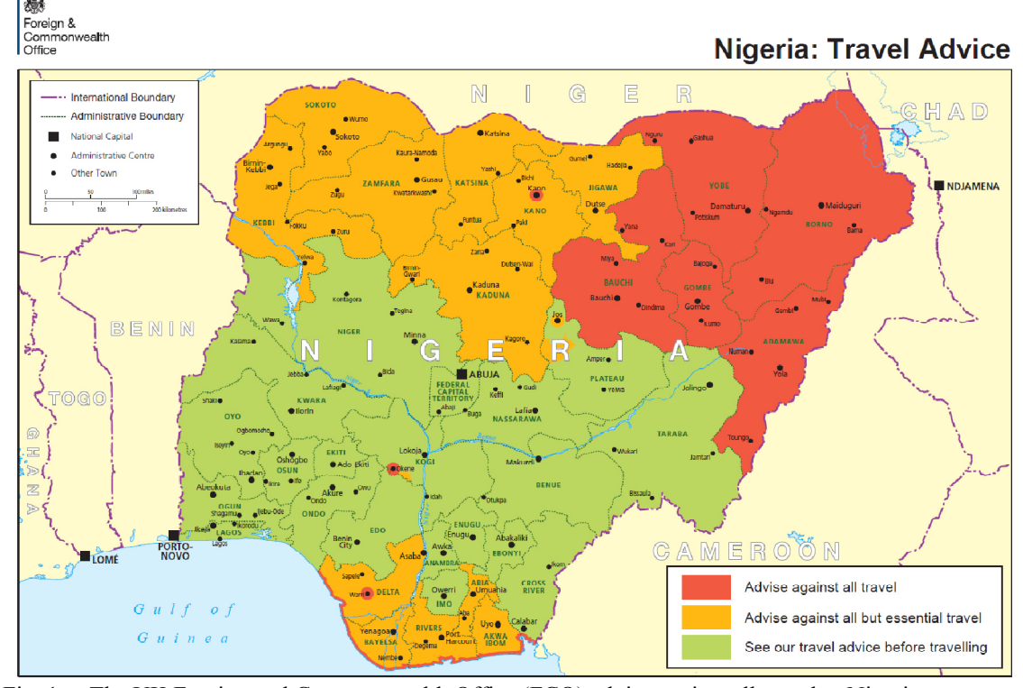
Fig. 1. The UK Foreign and Commonwealth Office (FCO) advise against all travel to Nigeria

In each of the chosen states, the state capitals were selected, consequently IDPs in, Akure, Osogbo, Ibadan and Ado-Ekiti were contacted for the study through Snowball sample method with multiple entry points into the communities being used. Faugier and Sargeant (1997) advised that when studying a hidden population for whom adequate lists and consequently sampling frames are not readily available, snowball sampling may be the only practicable method available. However, to reduce selection bias inherent in this method, adopting multiple entry points into the study communities have been suggested; choosing as wide a range of people as possible to provide further contacts to others (Bloch 2007, Jacobson and Landau 2003, Sulaimon-Hill and Thompson 2011). In all, 182 respondents drawn from the selected towns were involved in the study, with 39.6%, 23.6%, 19.8%, and 17% and of respondents IDPs from Ibadan, Akure, Oshogbo and Ado Ekiti respectively.