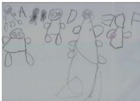
H ( 4years)