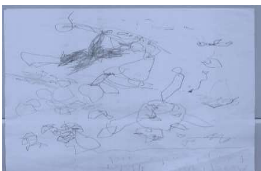
I ( 3 years)