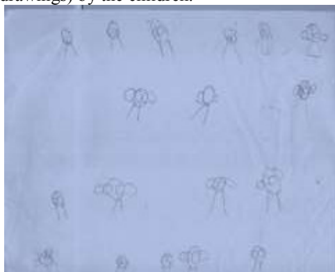
G ( 3years 4months)

Samples of children’s works were picked for teachers to interpret. Figure 2 presents a sample of such artworks (drawings) by the children.