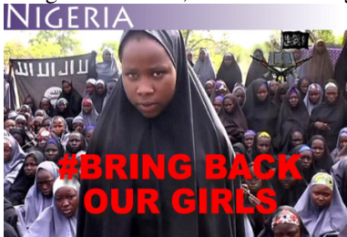
Fig. 1.

but a few intervened in the ongoing "BBOG" global campaign (Sonya, 2014 and Hugo, 2015). The picture below shows the Chibok secondary school girls abducted, in Northeast Nigeria.