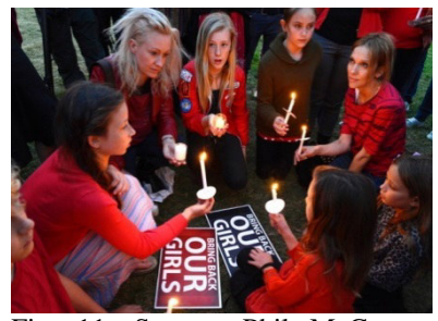
Fig. 11.

The pictures above show the social mobilization campaign for "BBOG" in solidarity for the abducted school girls, in the northeast Nigeria. [Fig. 9] picture shows the European Student Union, added their voice to the global campaign, holding up different alphabet that made up the phrase reading "Bring Back Our Girls". These are students from different parts of European nations, and probably with different religious, gender and cultural background, who creatively display and demonstrate their support for the release of the abducted school girls. In the foreground are five students holding up signs of the alphabet "Girls" and immediately behind them are all students different alphabet that make up "Bring Back Our", and at the background are the rest of the students standing in agreement behind those who hold the placard.