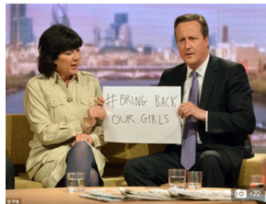
Fig. 5.

The pictures above show high profile personality, leading their support for the worldwide campaign for the safe return of the abducted school girls, with a placard signs reading "Bring Back our Girls" as a form of solidarity which reflects a collective identifications and emotion, for resources mobilization (Nicole, Alice & Simon, 2013) regarding the global outrage of the "BBOG" campaign. The [Fig. 3] picture shows Malala Yousafzai a seventeen year old female education activist from Pakistan, her eyes is heavy with tears, and her face expresses concern for the abducted girls. Her mode of dressing shows she is a Muslim. Though, report revealed that, over 90% of the abducted girls belong to the Christian religion (Owojaiye in Stoyan, 2014). This female education activist set apart her religion to support the release of the girls. A meaningful interpretation of this is that, regardless of religious beliefs and affinities, humanity must be protected and human rights must be observed. The participation of the female education activist is normative and likened to that of 'moral' and not religious point of view. The gospel of moral and human resources, based on the resource mobilization theory includes integrity, solidarity support, sympathetic support, celebrity, leadership, experiences, labor and other resources, that make it possible, for social mobilization movements (Elwards & McCarthy, 2004; Elwards & Patrick, 2013).