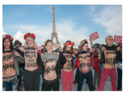
Fig. 8.

The pictures above show the mass mobilization across countries in campaign for "BBOG" in solidarity and concerned for the safe return of the abducted school girls by Boko Haram sect, in the northeast Nigeria. [Fig. 6] picture shows, a mass social mobilization rally by a group of women in red color material expresses, the consciousness of the danger the abducted girls are in, the touch of black, which can be seen scantly among the women with their emotional state of mind, as it suggest mourning among the Africans, especially Nigerians. The widely opened mouth suggests the women were echoing the same thing while their facial expression projected, anger, hopelessness, sadness, and disappointment. The appearance of the women, indicate they are mothers, and grandmothers. The cause of their campaign has overruled their religious inclinations and ethnic background. The involvement of women's in a clarion call for social mobilization movement, is most time employed, as an instrument for change, to bring cessation of conflict and in peace building efforts, to address the issues of social injustices among others (Lucy, 2011).