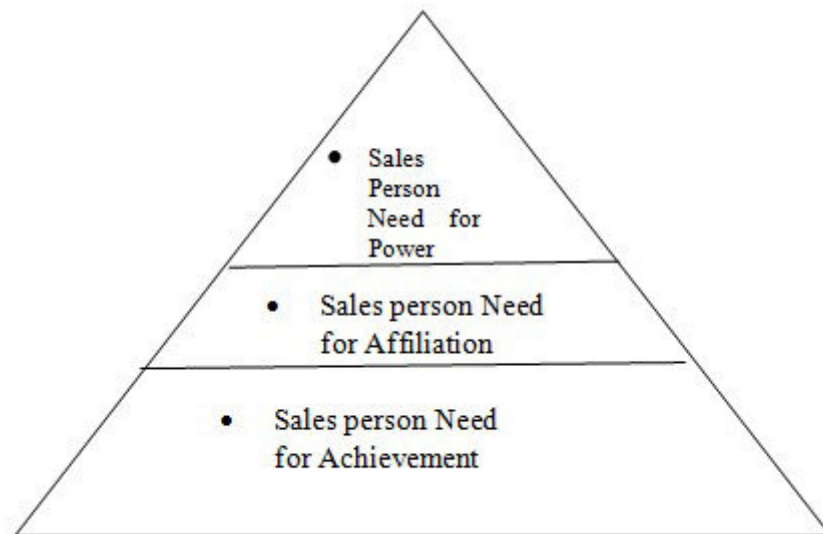
Figure 2: Salespersons Need for Achievement, Affiliation, and Power

The need for Achievement is the extent to which a salesperson has a strong desire to perform challenging tasks well and meet personal standards for excellence. Salespeople with high need for achievement often set goals for themselves and like to receive performance feedback. The finding of the study indicates that the need for achievement in an organization can be an unconscious drive to do better and to aspire to a standard of excellence. Therefore, salespeople with strong need for achievement often assess themselves as a way to measure progress towards their sale performance. They set goals; strive to take moderate risks (that is to say challenging but realistic sales accomplishments); prefer individual activities (such as specific sales quota); prefer recreational activities during which a person can set a score, and prefer sales task where performance data are clearly available. The motive behind need for achievement can be fulfilled through food, shelter, clothing, healthcare, job security, safety, income security. Therefore, examining this need in the light of Maslow's hierarchy of needs and the findings of this study, it is suggested that the possible sales managers' actions should be to provide/offer adequate income and good benefits package, provide safe work environment set mutually agreed-up performance standards, communicate job performance expectations and consequences of failure to perform.